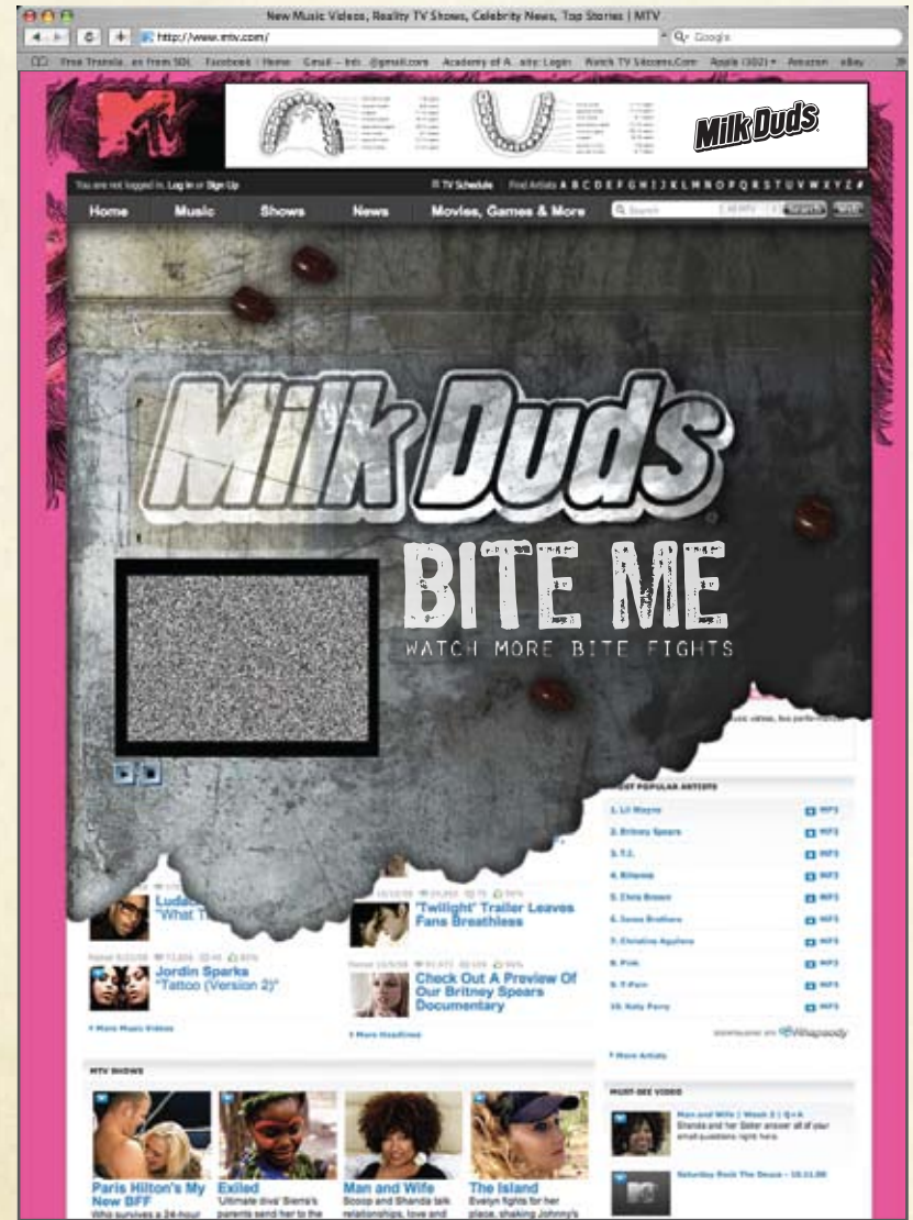
A Milk Duds MTV Takeover where pieces of the web page are bitten out to reveal information on "Bite Fights", joining "Bite Club", as well as an actual "Bite Fight" video.