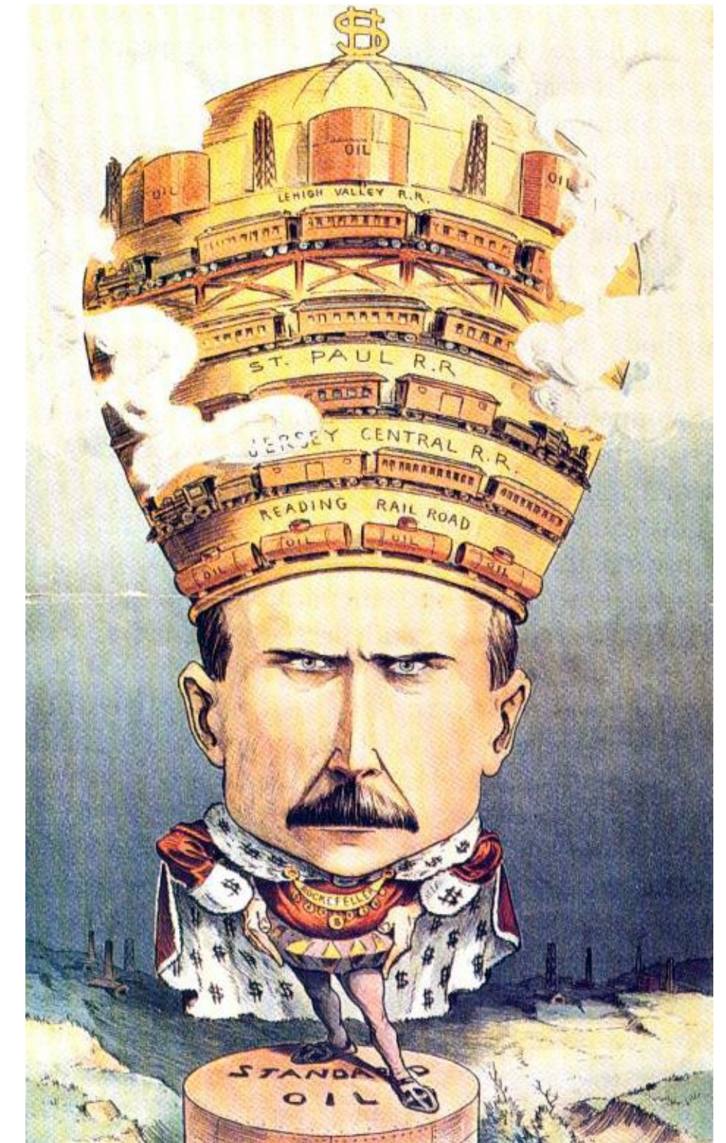
Rockefeller as industrial capitalist king

HENRY FORD SAID THAT ALCOHOL WAS "A CLEANER, NICER, BETTER FUEL FOR AUTOMOBILES THAN GASOLINE"