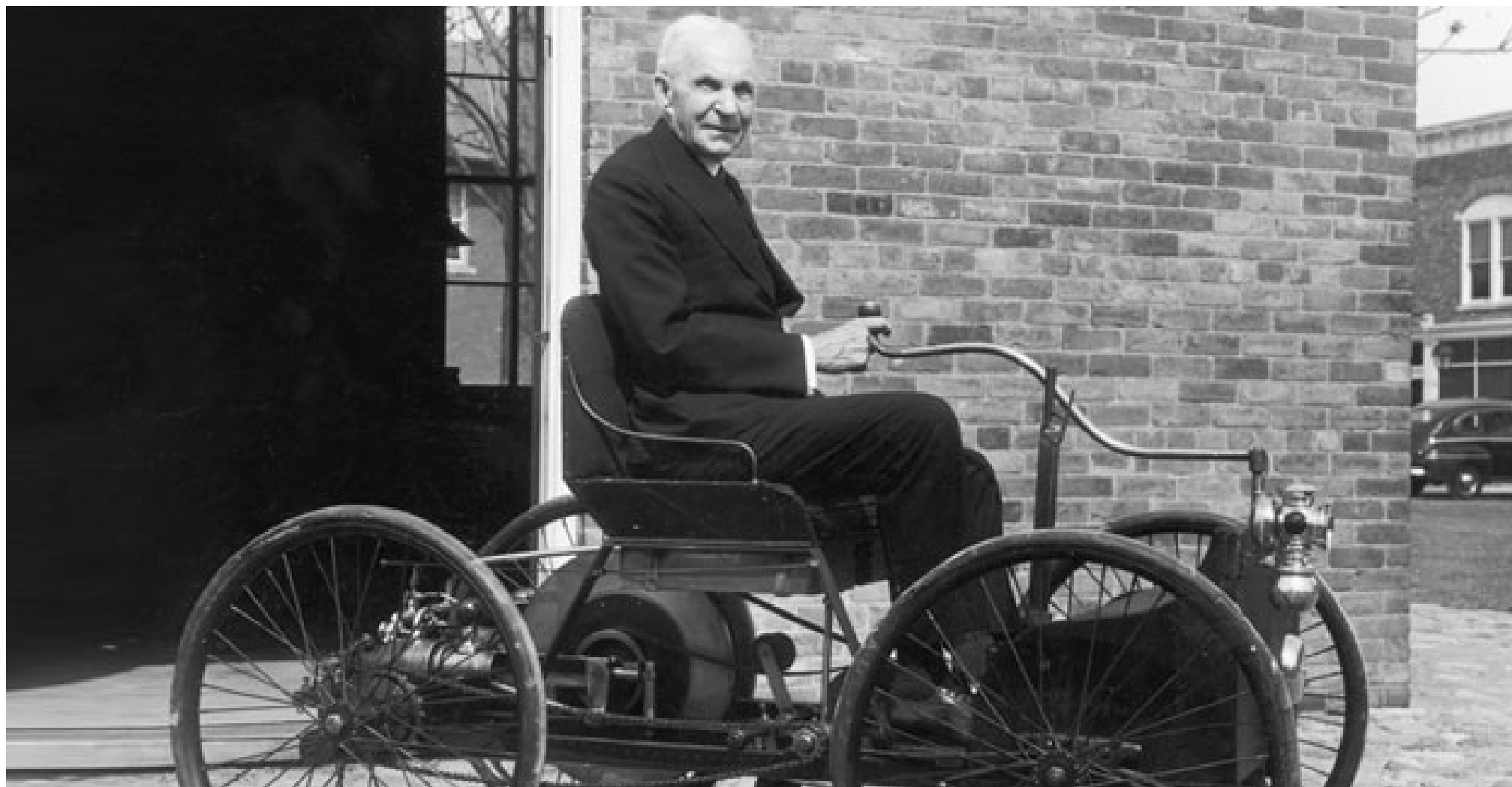
1896. Henry on his first car model

Henry Ford (1863-1947) is credited with mass producing the gasoline engine. By 1932, Ford controlled over 1/3 of gasoline engine production worldwide.