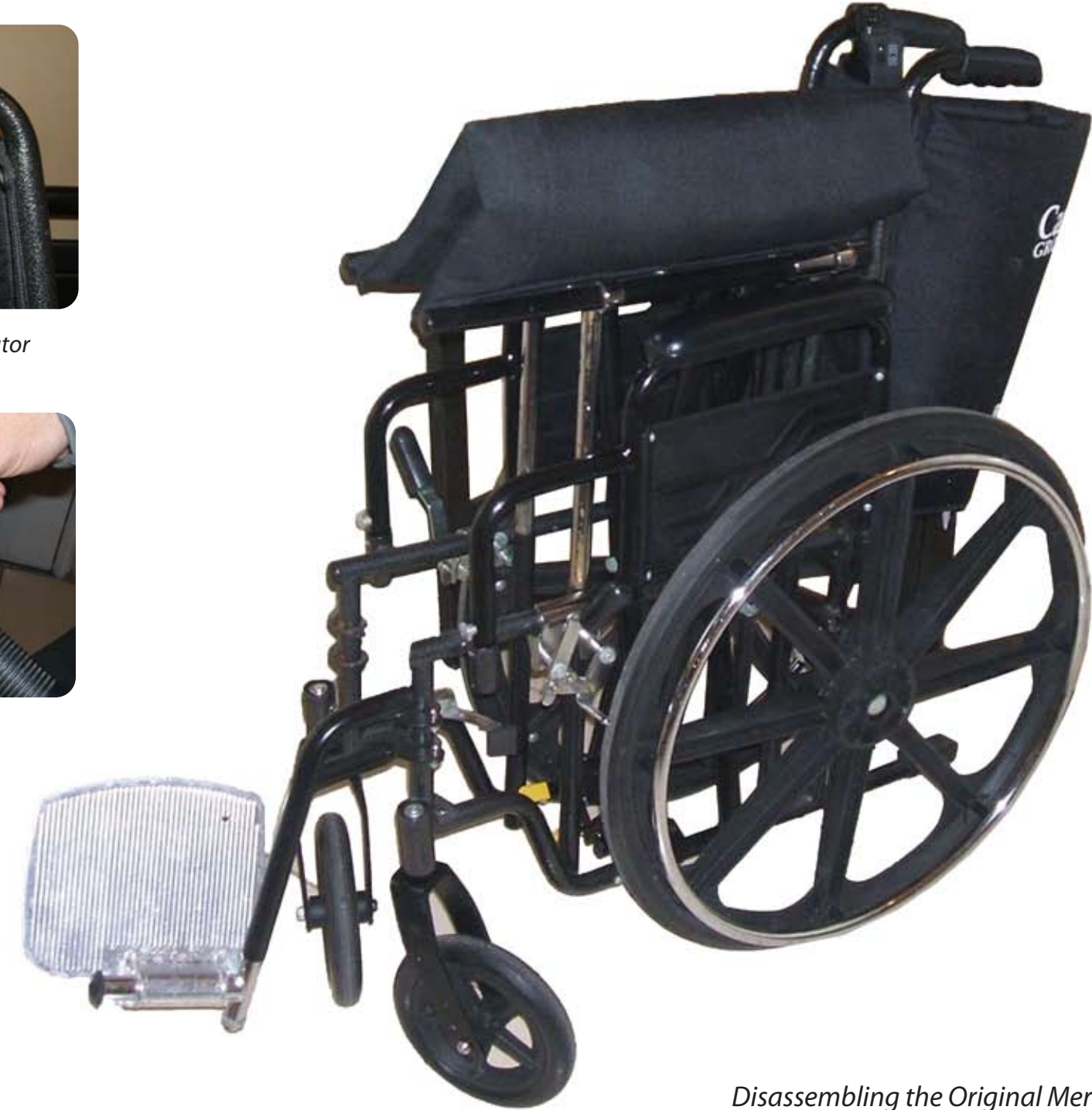
Disassembling the Original Merits heavy duty wheelchair. The capacity of the frame is 350 lb