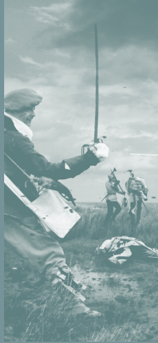
Sword warfare was used in the American Civil War.