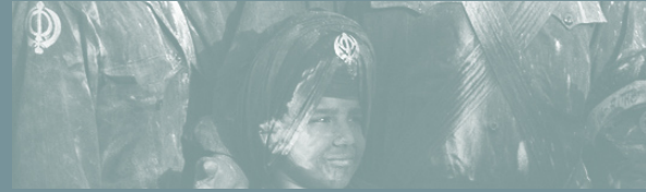
This young boy wears a traditional emblem with a Kirpan.

The Kirpan was a ceremonial sword or dagger that was worn by all baptized Sikhs (Khalsa), after a mandatory religious commandment given by Guru Gobind Singh (the tenth Guru of Sikhism) in 1699 AD.