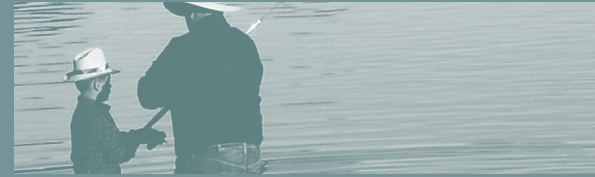
A young boy usually gets his first pocket knife from his father or grandfather.

A pocketknife fits inside the handle and that is small enough to fit in a pocket. Pocketknives are very versatile tools, and may be used for anything from opening an envelope, to cutting twine.