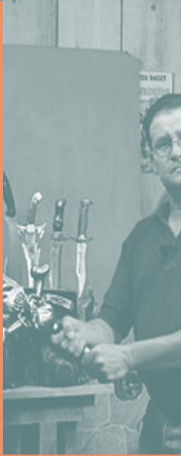
A collector of decorative and 'fetish' edged weapons shows off his arsenal.

The dagger plays a significant role in some cultures through ritual and superstition, as the knife was an essential tool for survival since early man. Today knives are sold as folklore and relics from our ancestors.