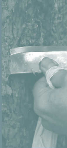
A 'Bowie Knife' at work in the wilderness