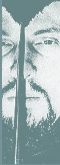
Church of Satan founder Anton Levey was well known dagger enthusiast.