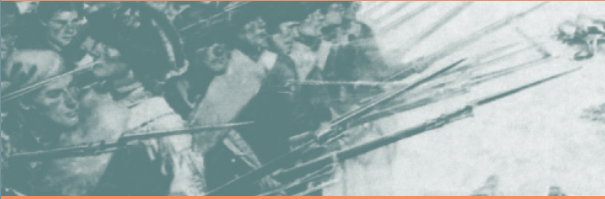
French revolutionists were notorious bayonet users.

A knife bayonet is a knife or short sword which can be used both as a bayonet. The knife bayonet became the almost universal form of bayonet in the 20th century due to its versatility and effectiveness.