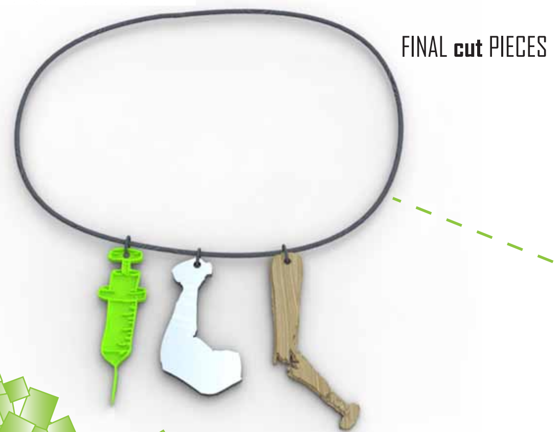
laser CUT from material SHEET