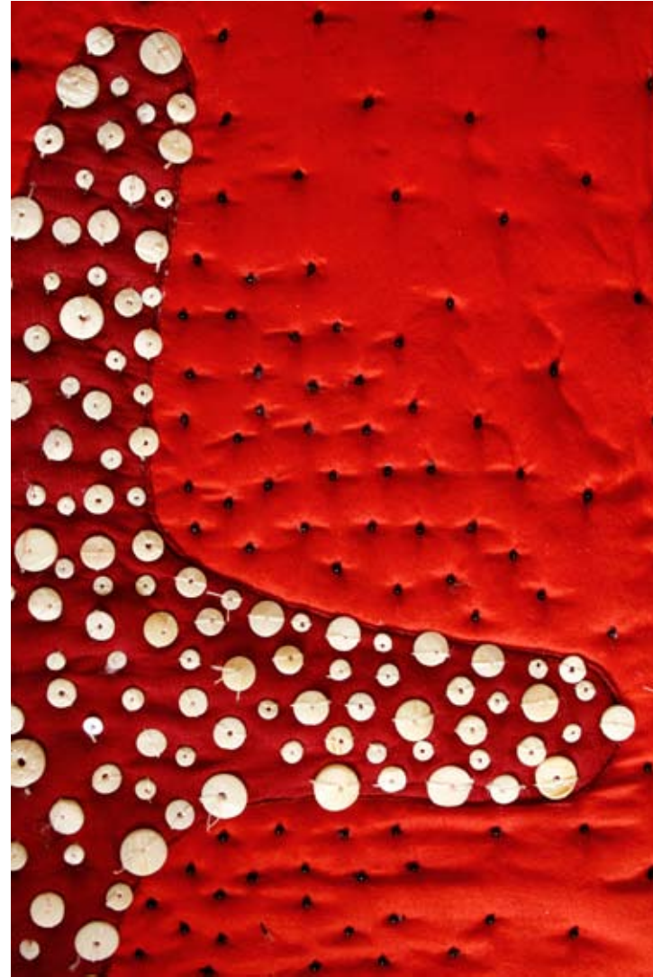
Quilted Surface and Beadwork