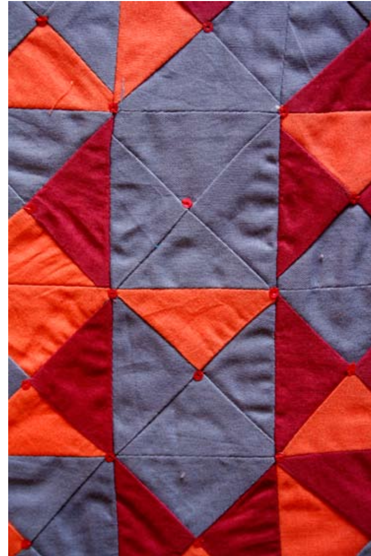
Patchwork with minimal sequins