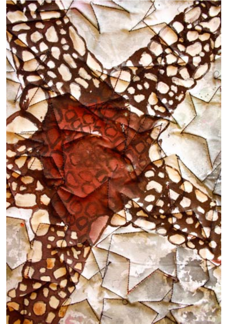
Hand Painted and Quilted Surface