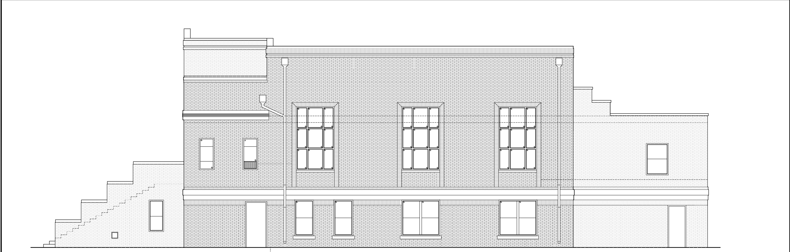
1 RIGHT ELEVATION SCALE 1/8" = 1'-0"

This file is an instrument of service and is to be used solely for the purposes stipulated under separate executed contracts with the Designer. This document is copyrighted and is not to be used, duplicated or otherwise modified except with express permission of the Designer.