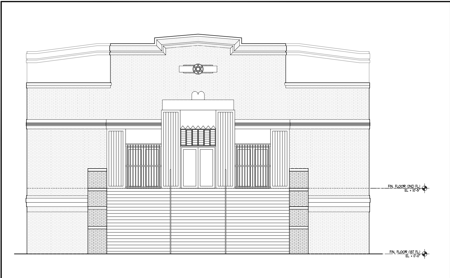
2 FRONT ELEVATION SCALE 1/8" = 1'-0"