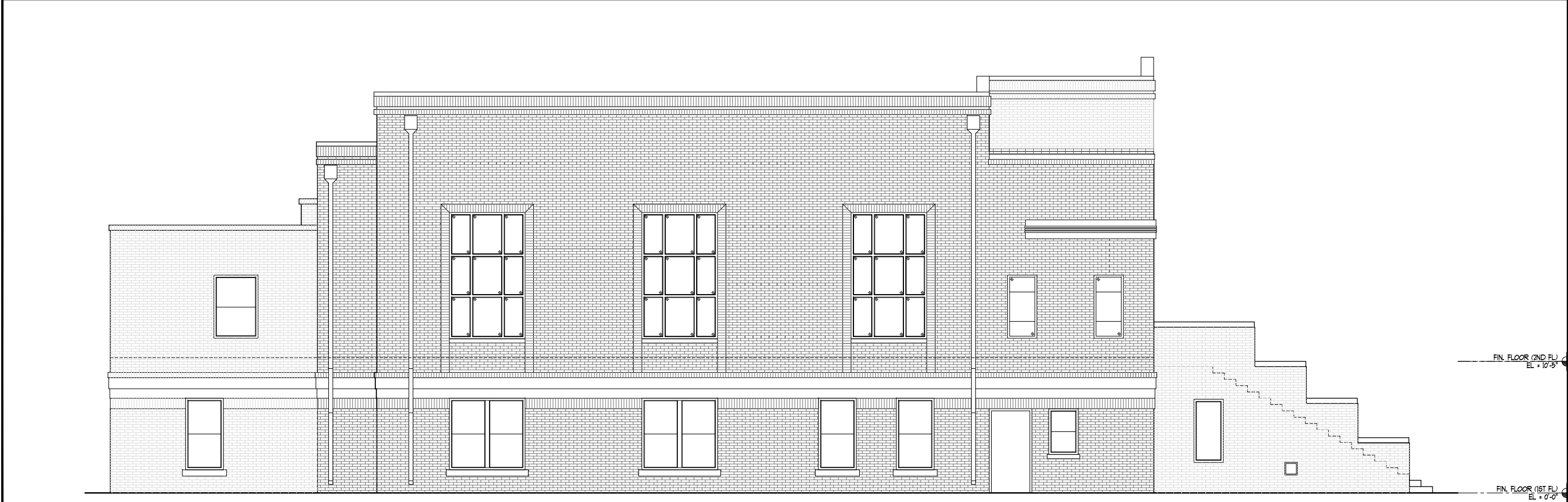
1 LEFT ELEVATION SCALE 1/8" = 1'-0"

This file is an instrument of service and is to be used solely for the purposes stipulated under separate executed contracts with the Designer. This document is copyrighted and is not to be used, duplicated or otherwise modified except with express permission of the Designer.