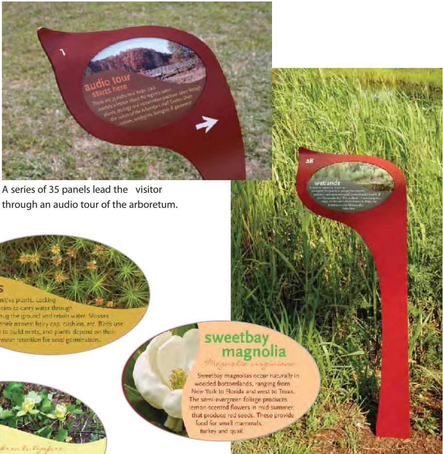
A series of 35 panels lead the visitor through an audio tour of the arboretum.