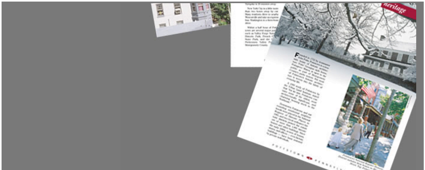
24-page 4-color brochure promoting the Borough of Pottstown. Freelance