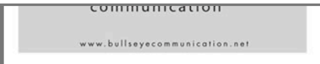
Advertisement to promote BullsEye Communications Freelance