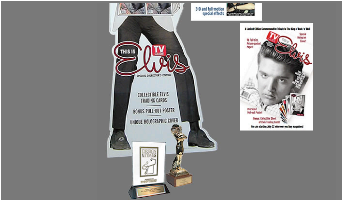
Point-of-Purchase life-size display, left, for TV Guide's "This is Elvis" stand-alone magazine. Right, various print ads to promote the product.