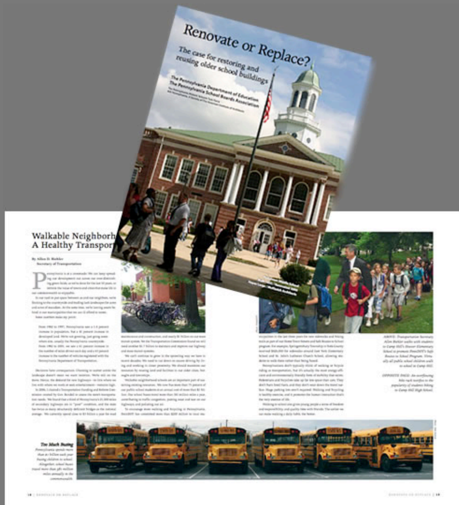
4-color promotional brochure for Pulitzer Prize-winning journalist. Freelance collaboration