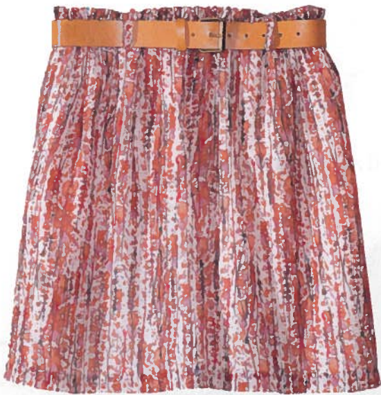
August Silk skirt and belt, $79; select Dillard's stores