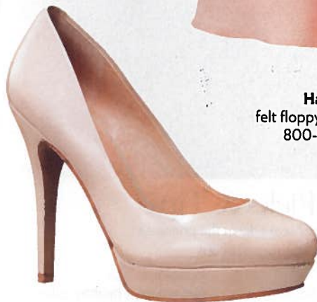
Arturo Chiang "Orina" platform pump, $69.99; select Dillard's stores