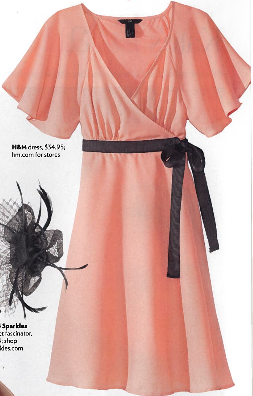
H&M dress, $34.95; hm.com for stores