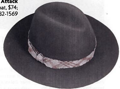
Hat Attack felt floppy hat, $74; 800-982-1569