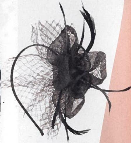
Shop 4 Sparkles feathernet fascinator, $24; shop 4sparkles.com