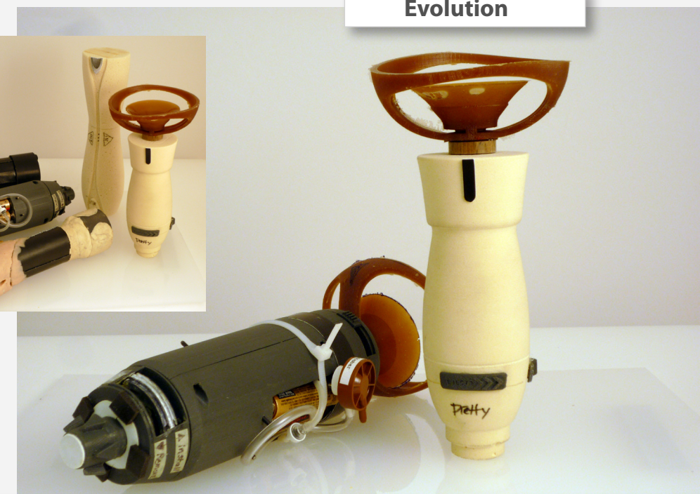
Foam Form Study