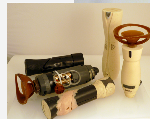
Working Prototype for User-Testing