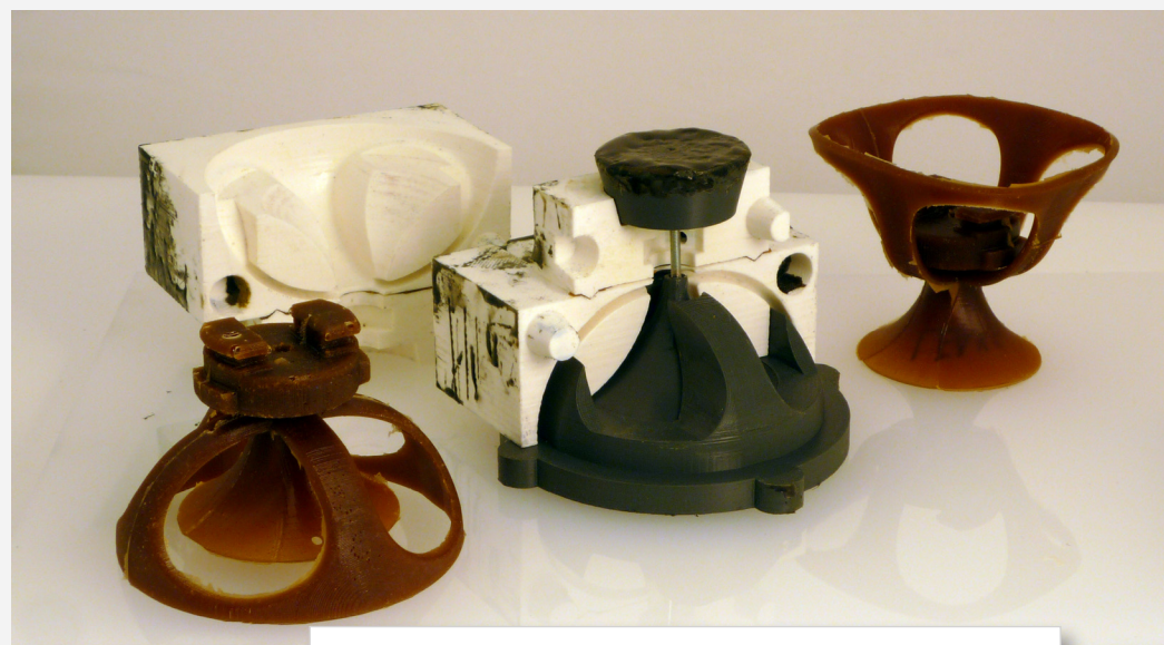
ABS mold RTV proof of concept parts