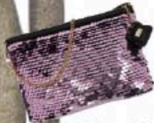
Dolce and Gabbana