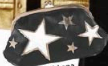
Dolce and Gabbana