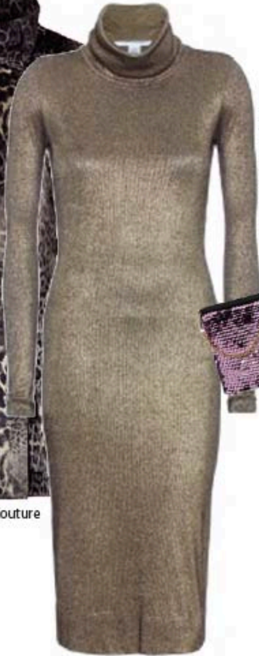
Diane Von Furstenberg