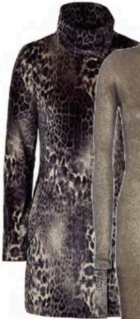
Bird by Juicy Couture