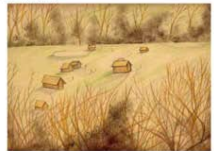
Illustrated reconstruction of site