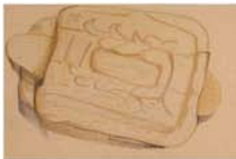
12th century Carving

The Levisham project was to create an exhibition on the Mystery of the church in the valley. The teams budget was £300, which paid for materials and traveling costs.