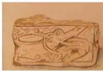
Celtic Carving of a Dragon