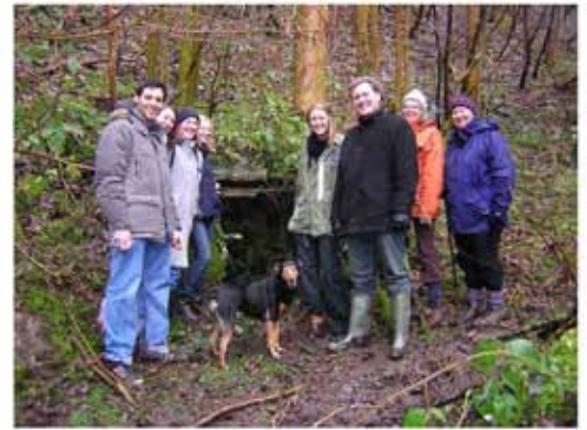
From Left to right the Levisham Team:

As part of the team I was asked to do the illustrations above and to the right. The 14th Century carving and the illustrated reconstruction were used in the final exhibition, which I helped construct.