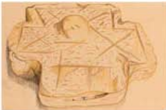
14th Century Carving