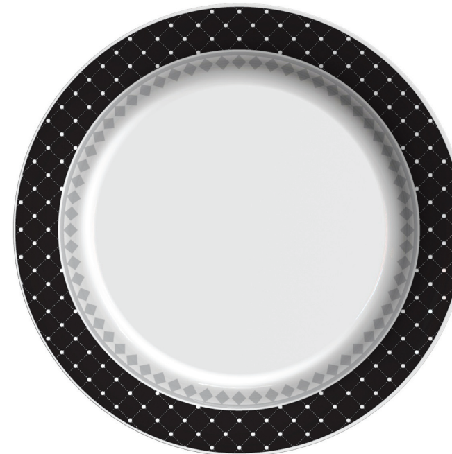
Paper plate & napkin set 1