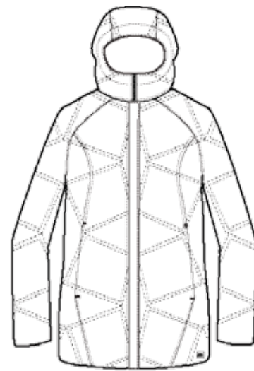
URBAN DOWN JACKET