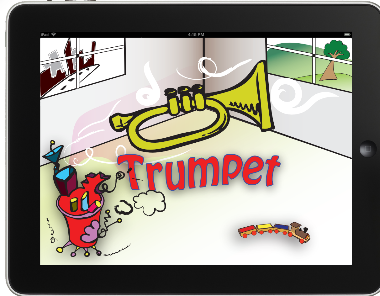
The Joggle Woggle was tapped, and a trumpet has popped out of the machine

Each item will fallback into the scenery. They will become additional "buttons" for the user to tap, in order to see and hear additional actions