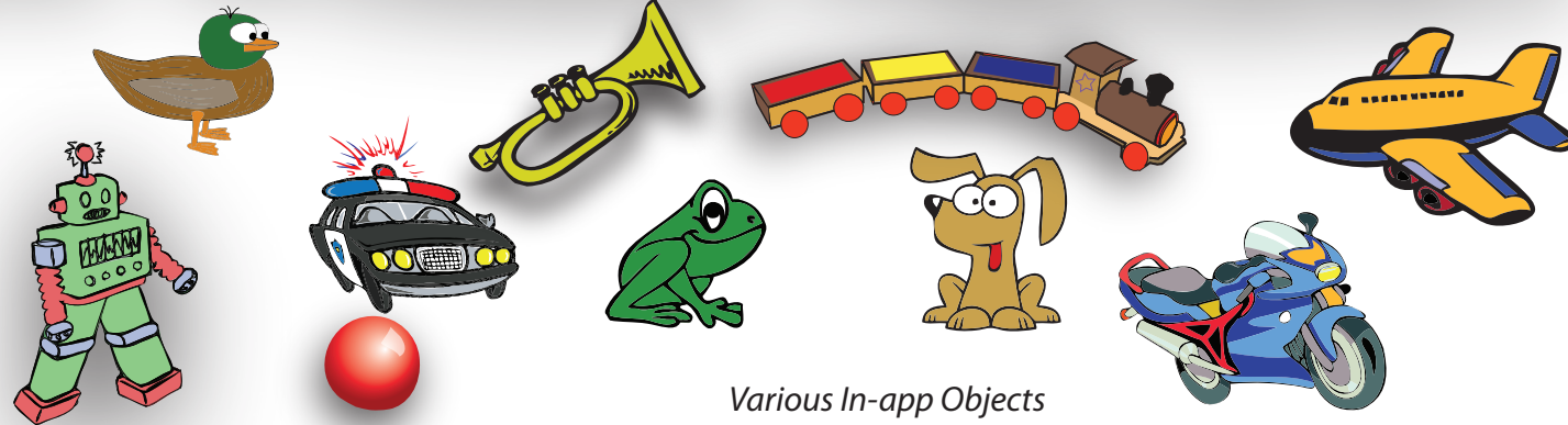
Various In-app Objects

Every time a Joggle Woggle is tapped, a new object will pop out of the Joggle Woggle Machine.