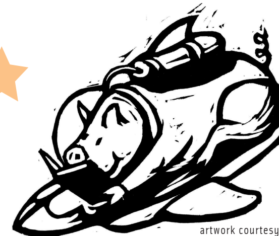
artwork courtesy of IREAD

THE END YOU HAVE FINISHED THE 2007 SUMMER READING PROGRAM! CONGRATULATIONS!