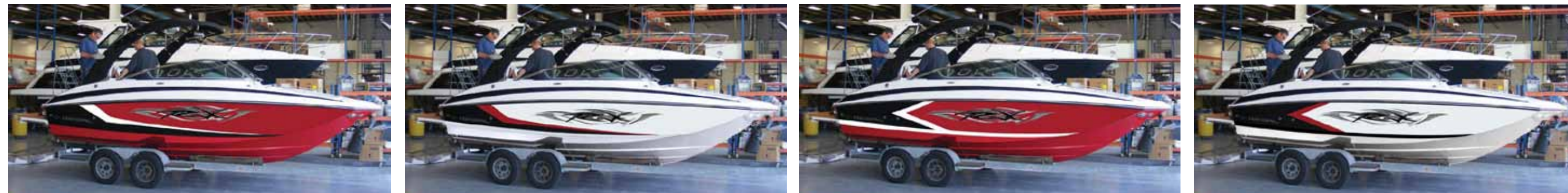
Select RX Graphics Concepts: (Photoshop)