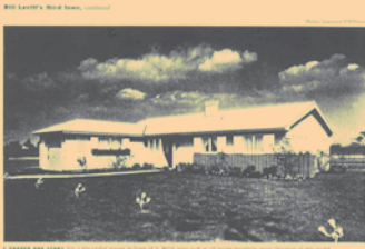
New one-story: open plan at $12,490