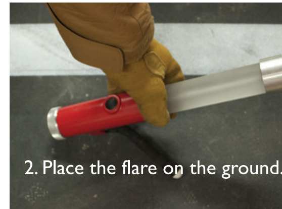
2. Place the flare on the ground.