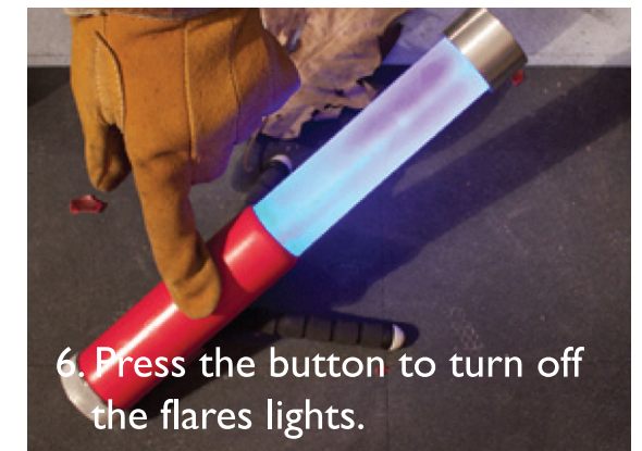
6. Press the button to turn off the flares lights.