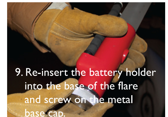
9. Re-insert the battery holder into the base of the flare and screw on the metal base cap.