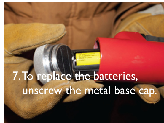
7. To replace the batteries, unscrew the metal base cap.