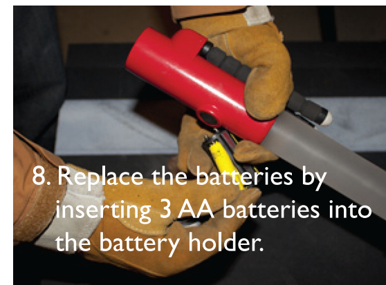
8. Replace the batteries by inserting 3 AA batteries into the battery holder.