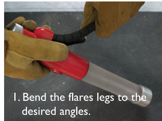
1. Bend the flares legs to the desired angles.