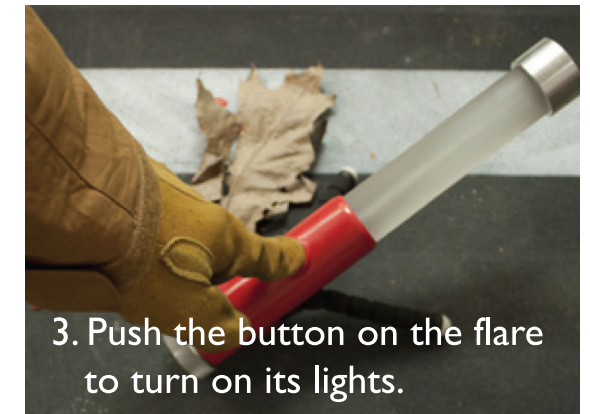
3. Push the button on the flare to turn on its lights.