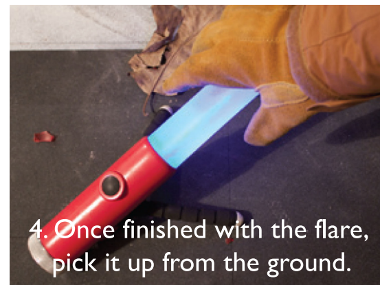
4. Once finished with the flare, pick it up from the ground.