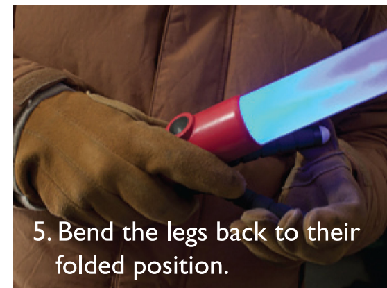
5. Bend the legs back to their folded position.