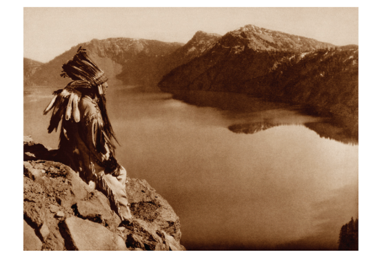
CRATER LAKE – KLAMATH, 1923

A regal portrait of three Sioux chiefs near the Badlands of the western Dakotas. Printed by Cardozo Fine Art. sku: SIOUX