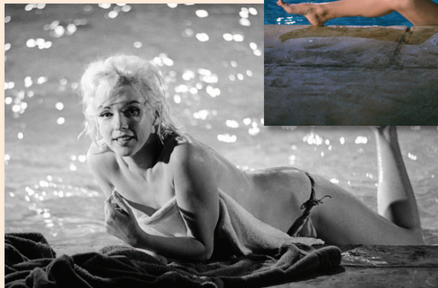
"A SPLASH OF MARILYN," MAY 1962 MONROE2

Rarely seen photographs of Marilyn Monroe, taken just weeks before her death in 1962, are being made available to the general public for the first time.