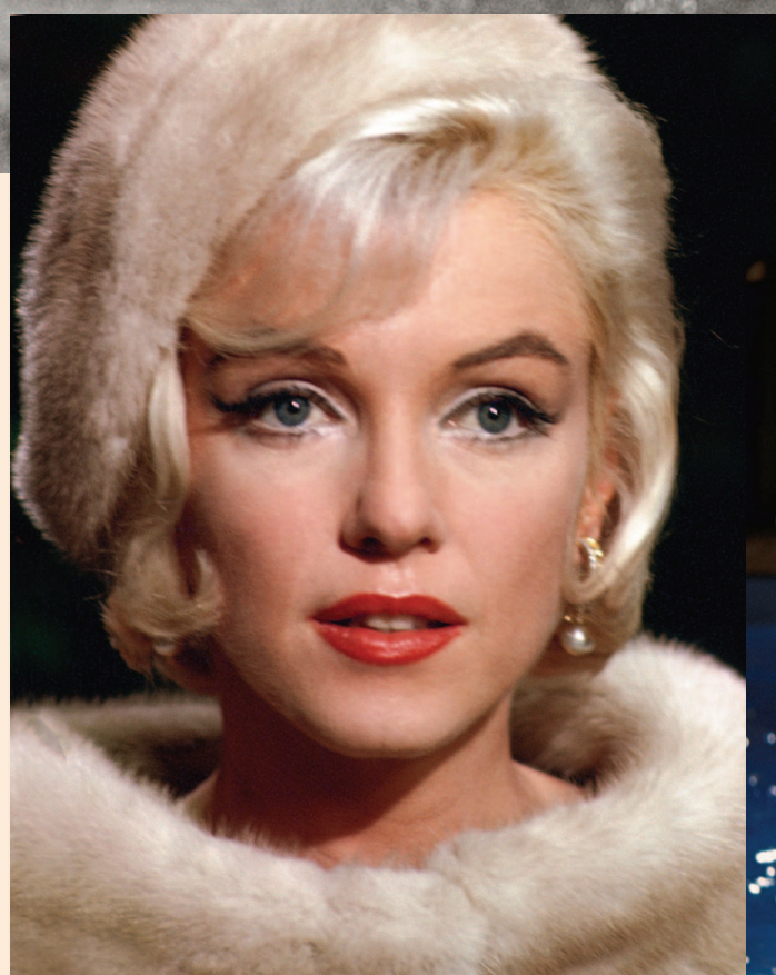
"WAITING FOR THE CAMERAS," MAY 1962 MONROE6

LIMITED-EDITION PRINTS FROM MARILYN MONROE'S LAST ON-SET PHOTO SHOOT