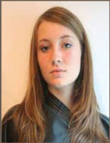
Model is a Natural Level 7