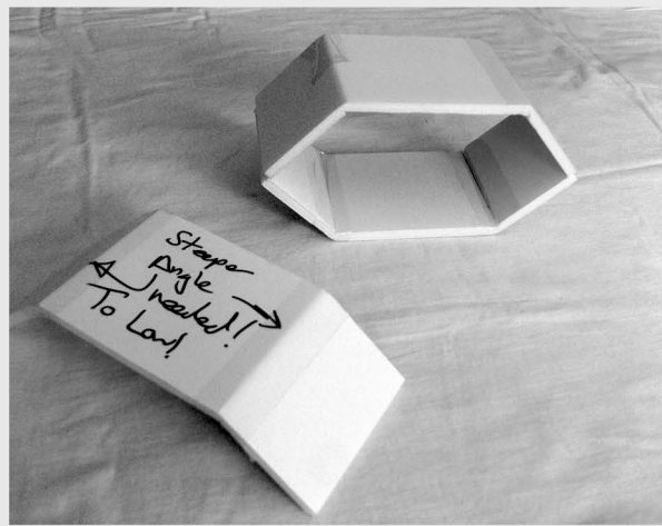
Sketch modelling / Form realisation

ACCESSIBILITY Difficulties for older users to interact with high cookers / washing sinks - Lap based would be better / low table. ENERGY Whole area / fridge need to heat / lost press only 1 item = Massive waste of space + power. SPACE MESS Dirty food / Dishes get moved around + left for washing up at a later date. STORAGE Social Breakdown! Lx fr. dinner + families not eating together. Pots / cooking needs to be reintroduced into the family environment. LIFESTYLE / FAMILY heavy + takes ages to set up.