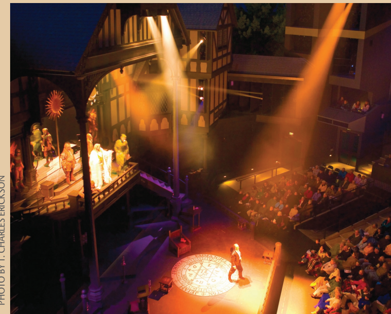
The 2007 outdoor season presents Shakespeare's The Tempest , The Taming of the Shrew and Romeo and Juliet . Featured in the photo above is the 2005 set and ensemble in The Tragical History of Doctor Faustus .

Despite the passing of four centuries, Shakespeare is still widely considered the master of giving poetic voice to humanity's most enduring troubles — one of which is the end of summer.