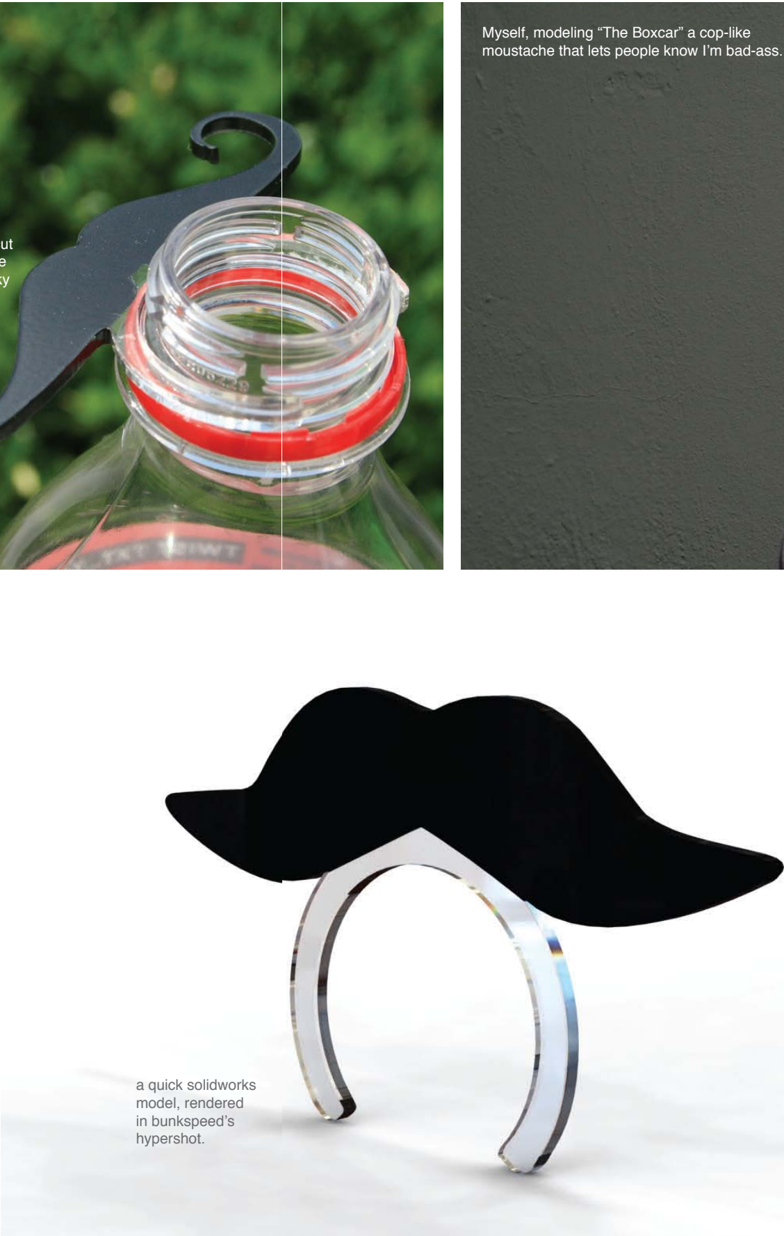
a quick solidworks model, rendered in bunkspeed's hypershot.