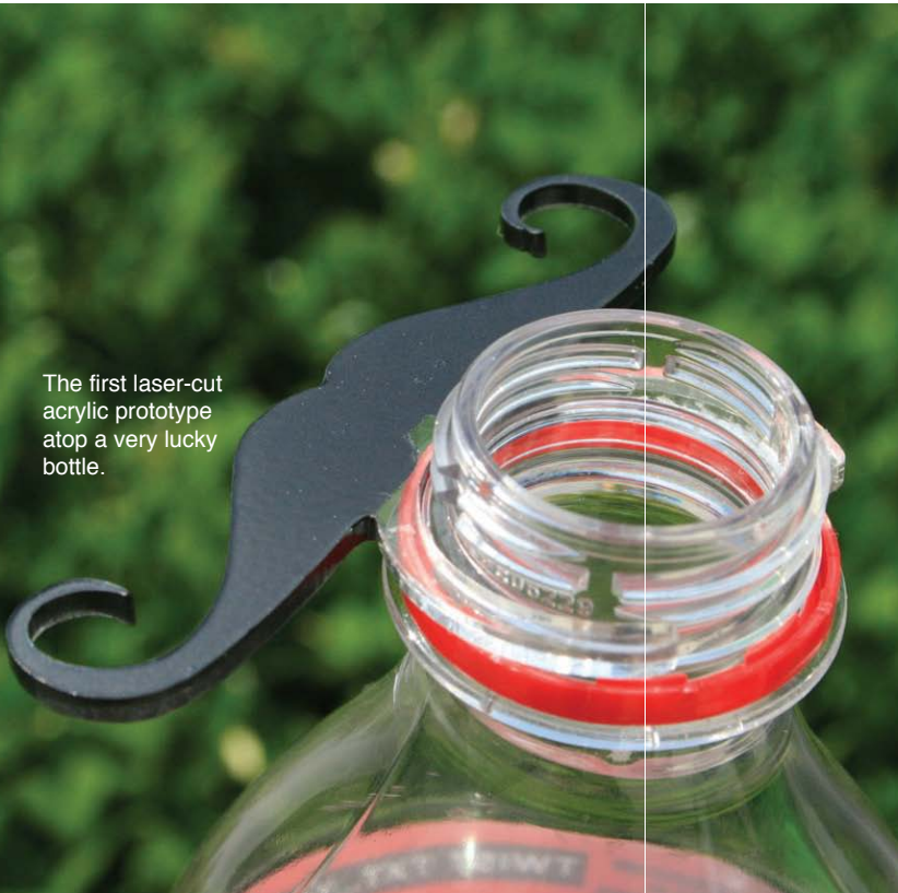
The first laser-cut acrylic prototype atop a very lucky bottle.