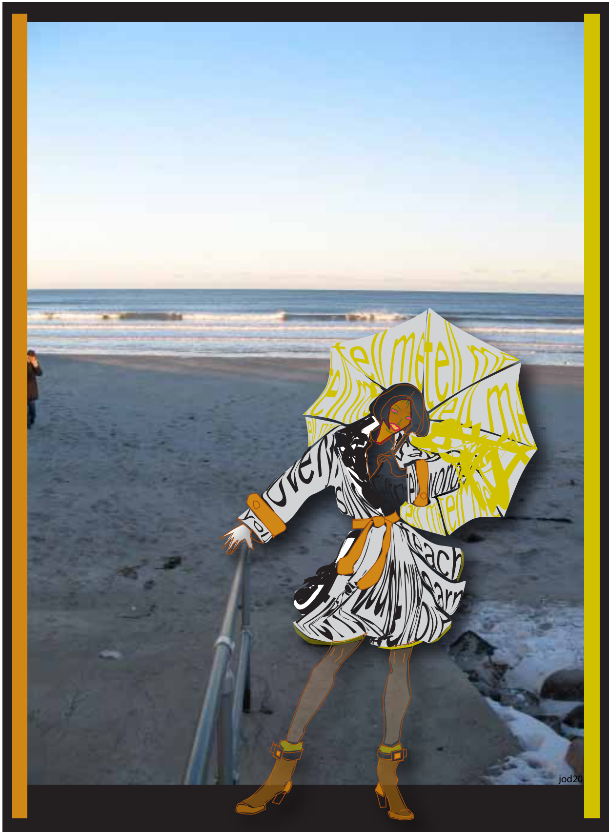
stepping out of the image area