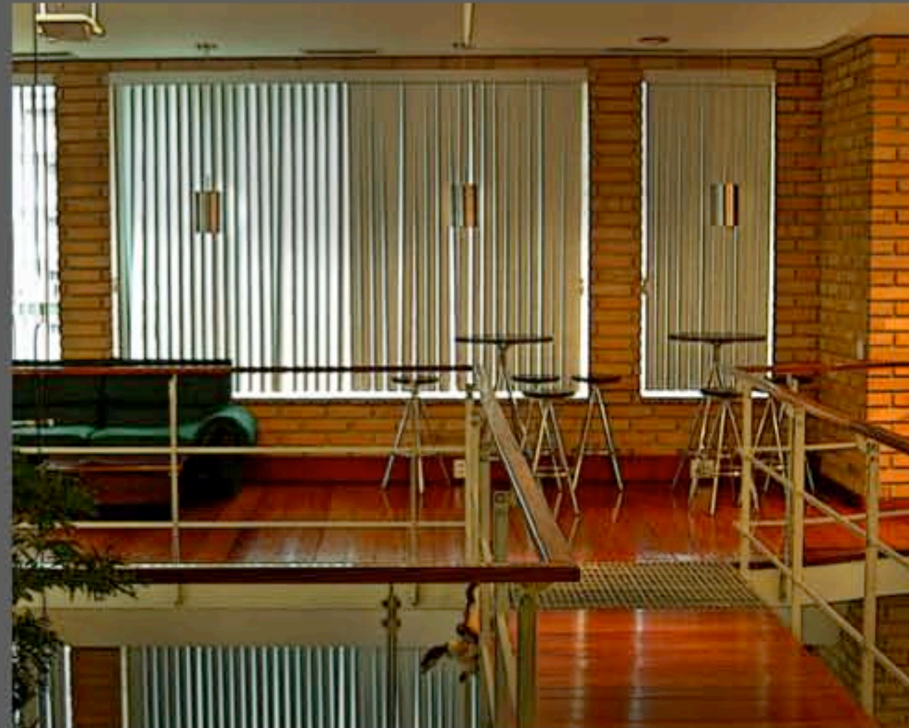
Passage way crossing over the 9 th floor into the lounge area

The giant banana is a pop-art piece based on an original painted version by Andy Warhol.