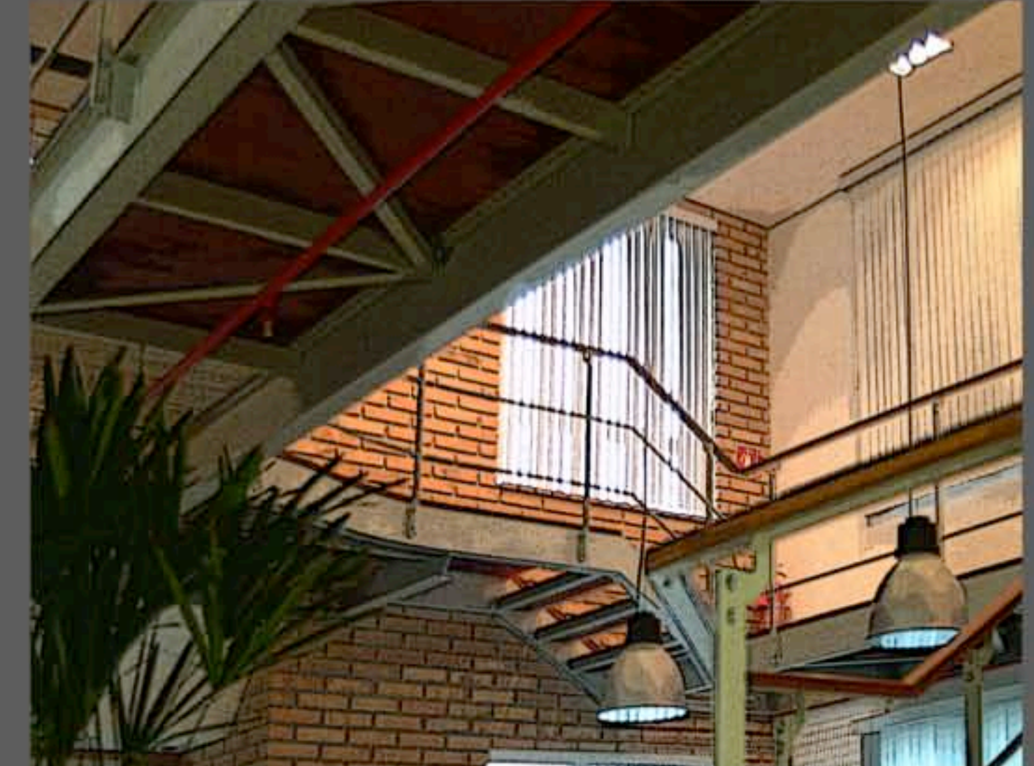
View from below – Detail of passage way bracings. Two of the industrial pendant lights are visible at the right