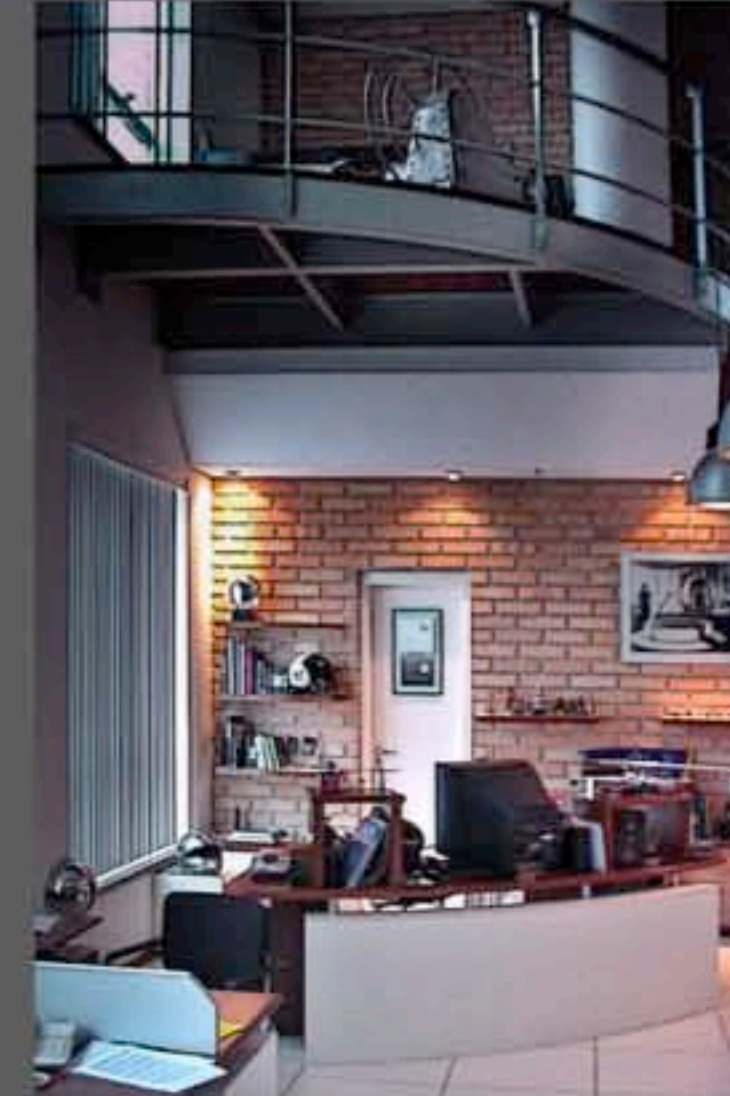
Design manager area below the "canopy" created by the café.