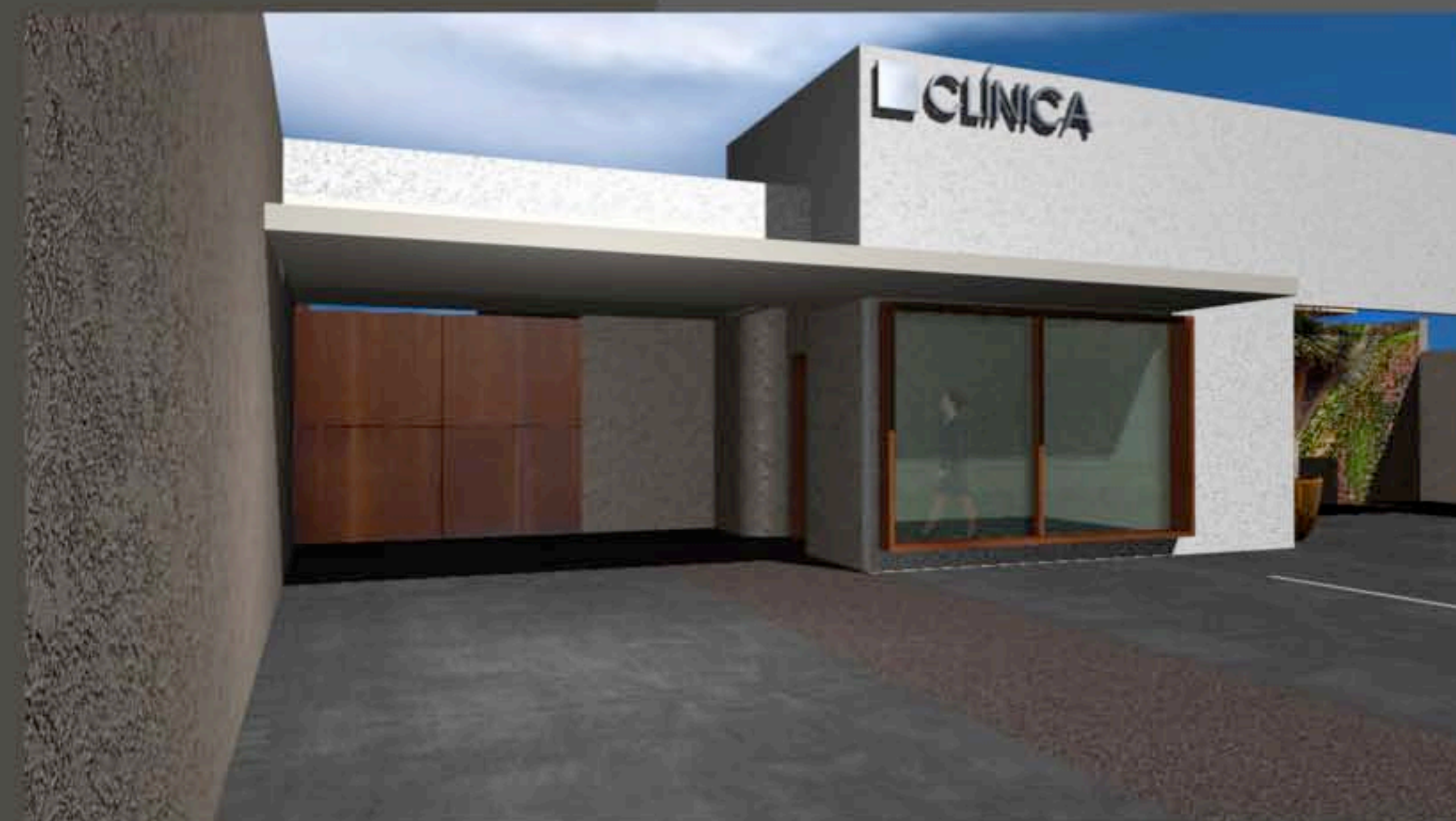
Front Façade – Rendering

Front Façade – Since the parking area was occupying most of the set back area at the front, a single vase with a vertical garden background at the niche was proposed