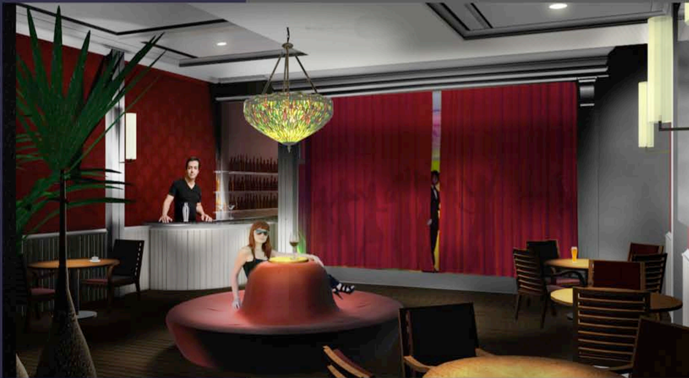
Front Lounge – Rendering

São Paulo, March 2005 with Nidia Freitas