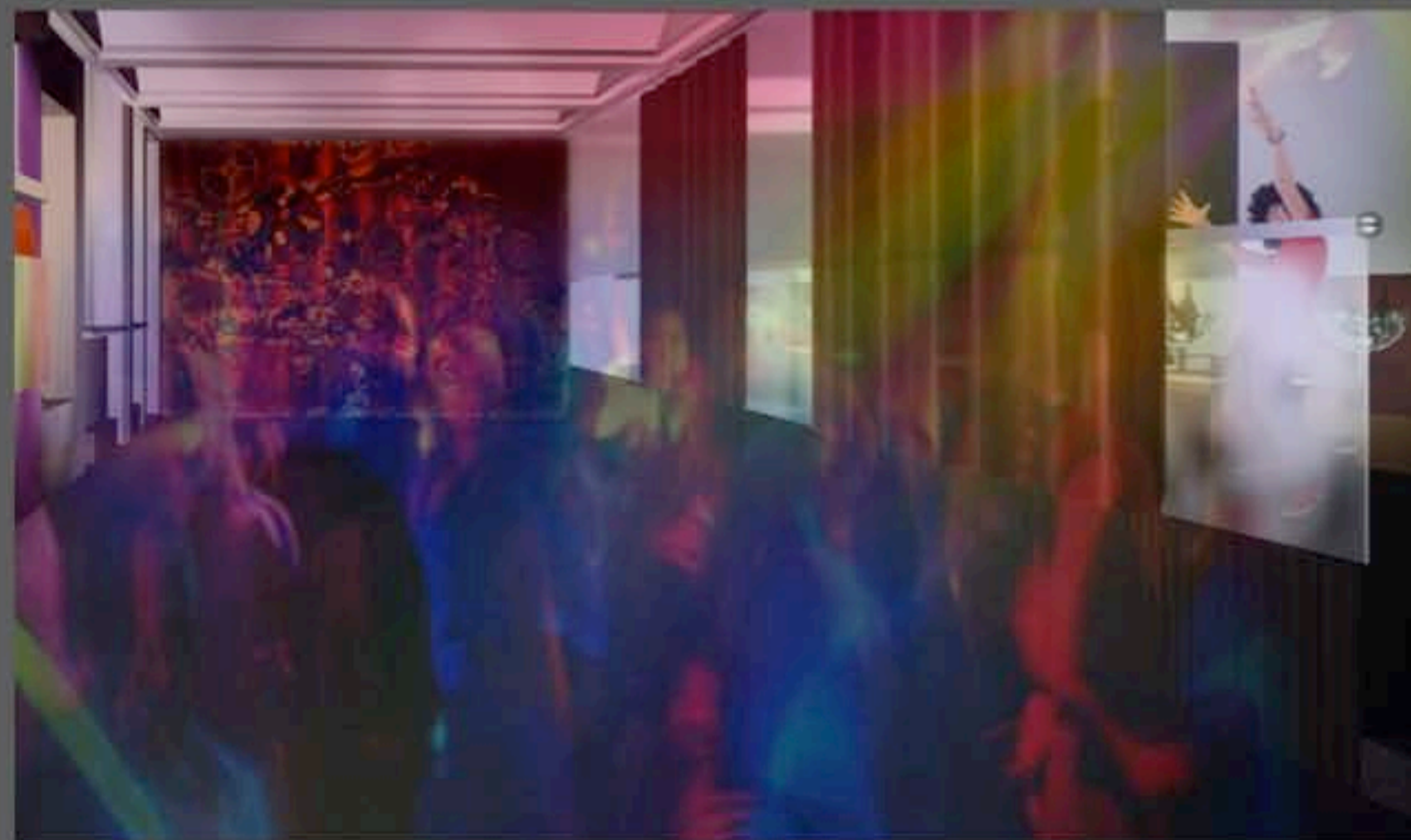
View of Dance Floor and elevated booths – Rendering

For the exterior the concept goes with a discreet façade with subtle textural and lighting effects