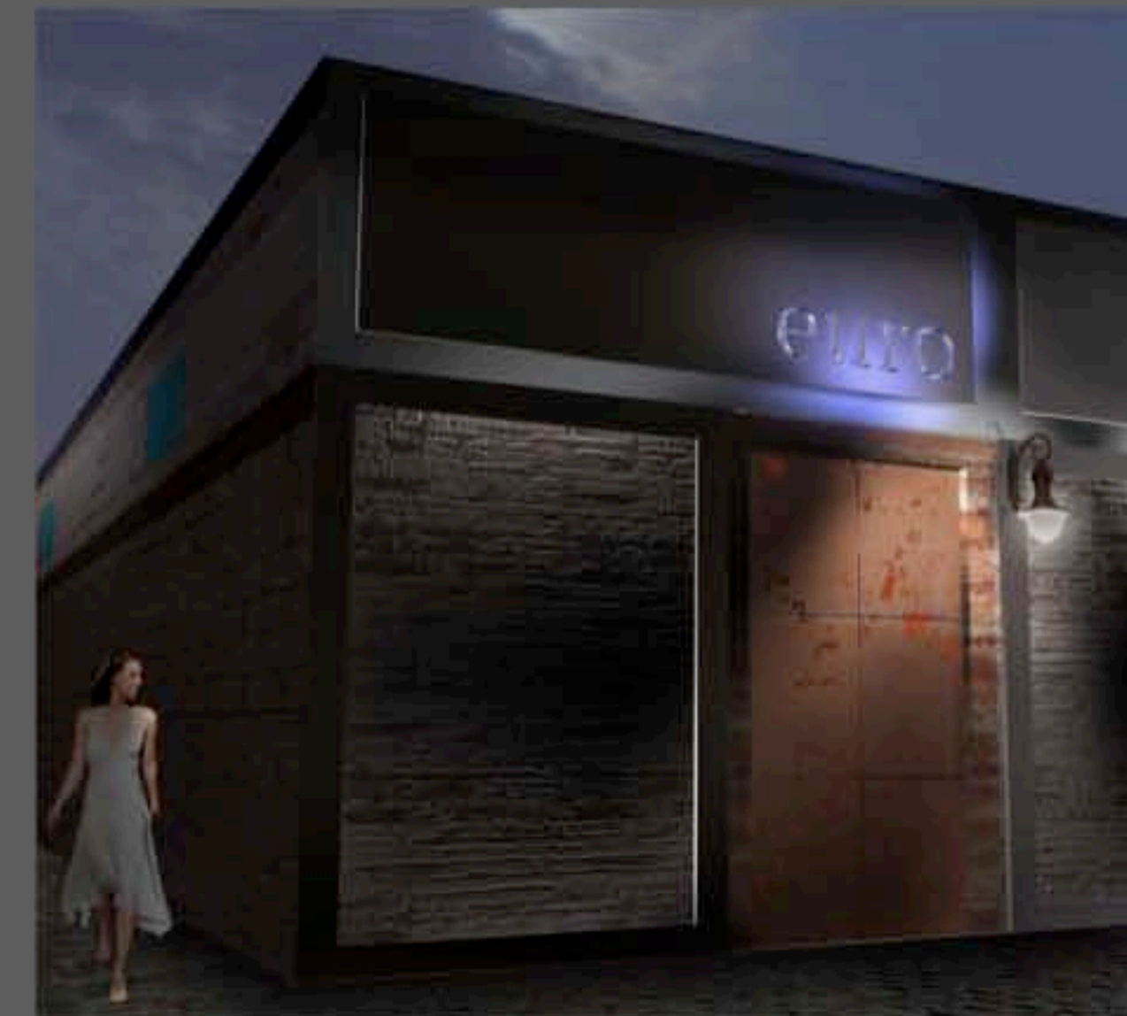
Front Façade – Rendering

Softwares : VectorWorks Cinema 4D Photoshop