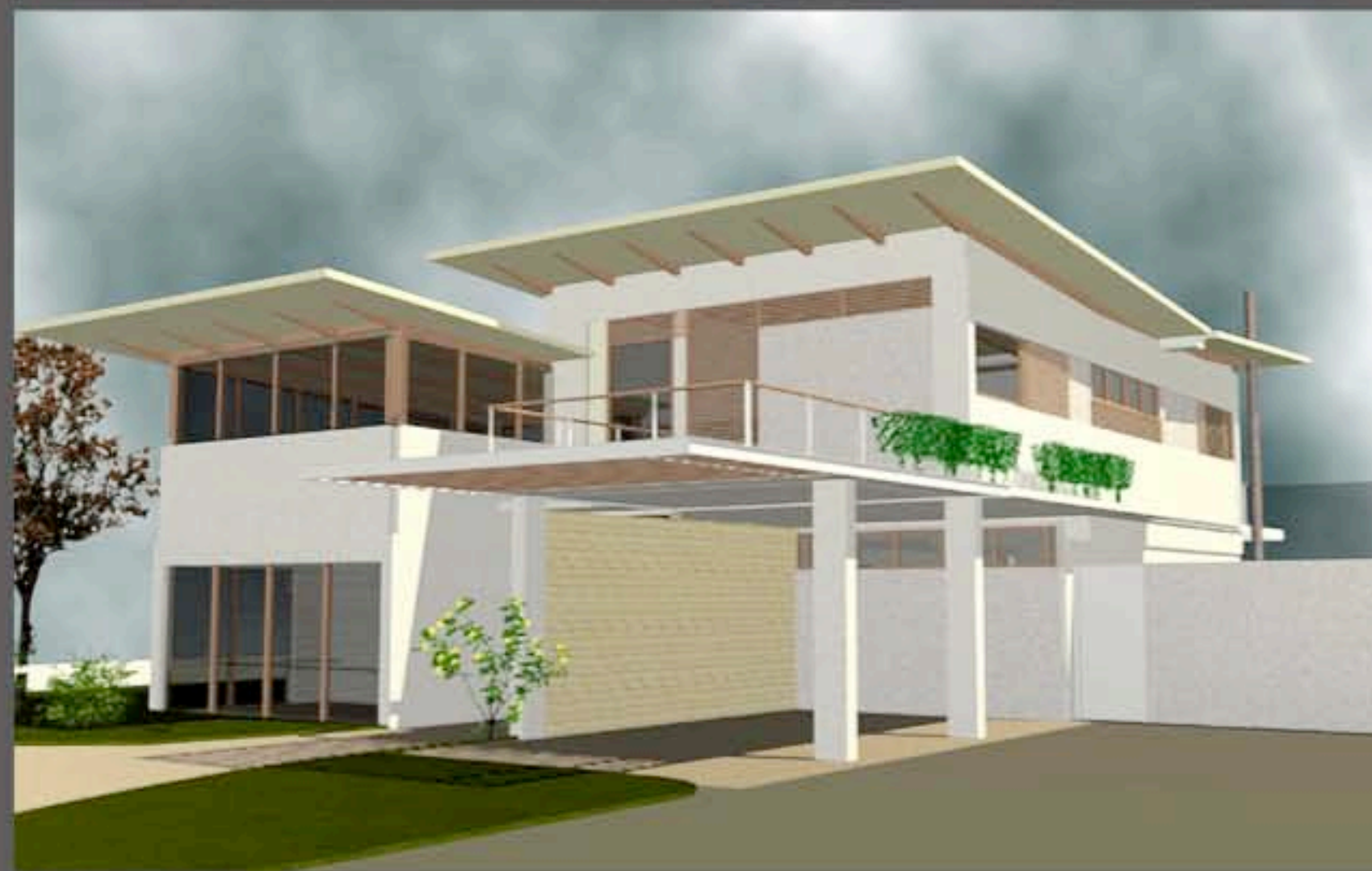
Front Façade View - Day time – Rendering