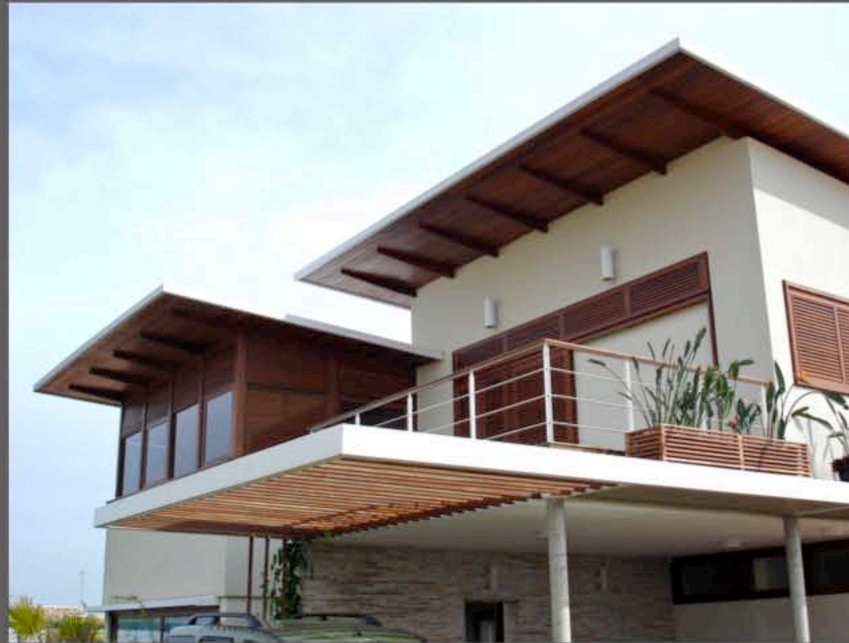
Front Façade View - Day time - Photo

Softwares : VectorWorks Artlantis Photoshop