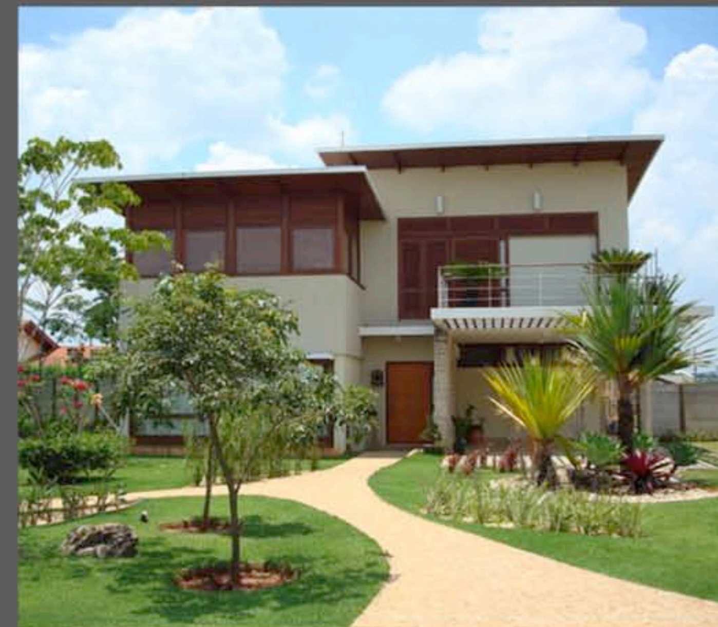
Landscape and Façade View - Day time - Photo