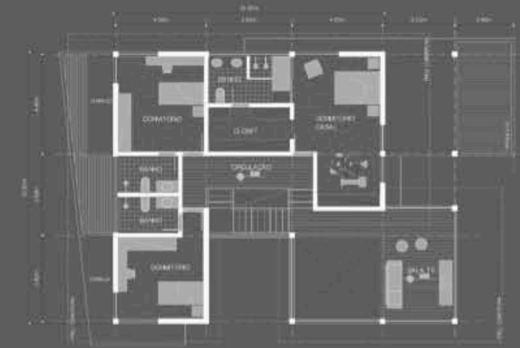
First Floor Plan – CAD Drafting