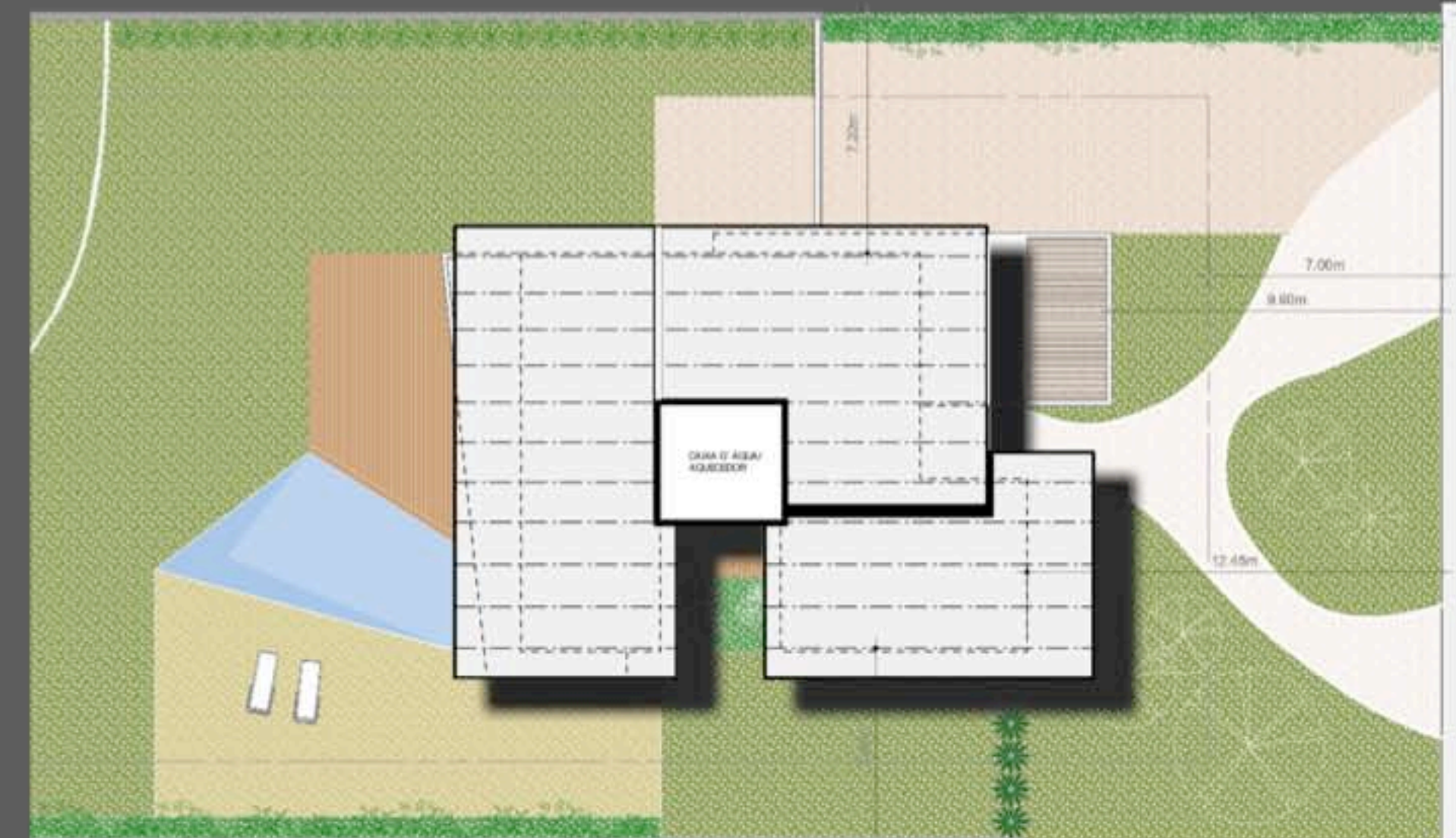
Site Plan - Rendering