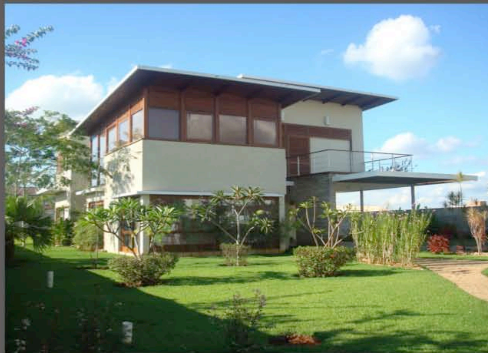
Landscape and Façade View - Day time - Photo