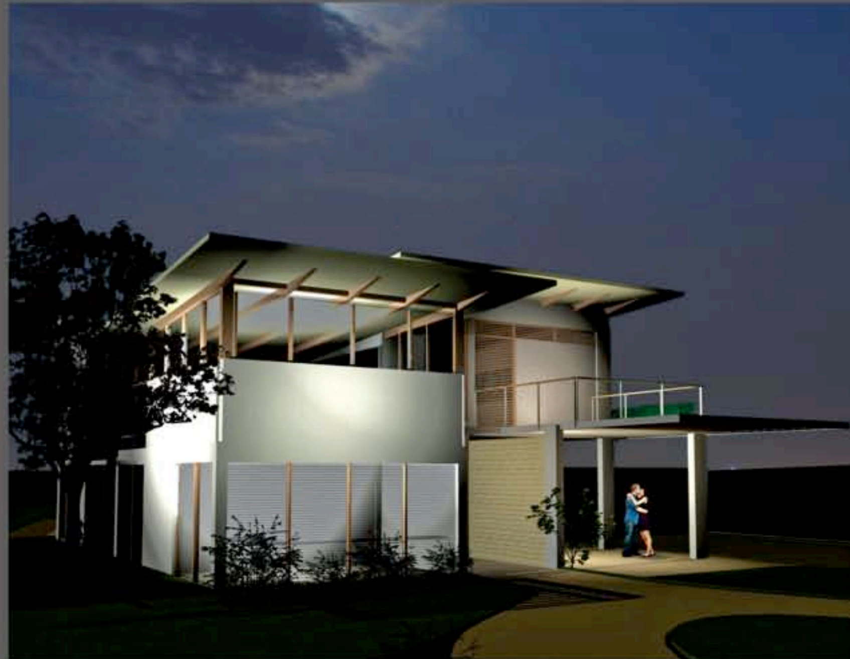
Front Façade View - Night time – Rendering

Softwares : VectorWorks Artlantis Photoshop