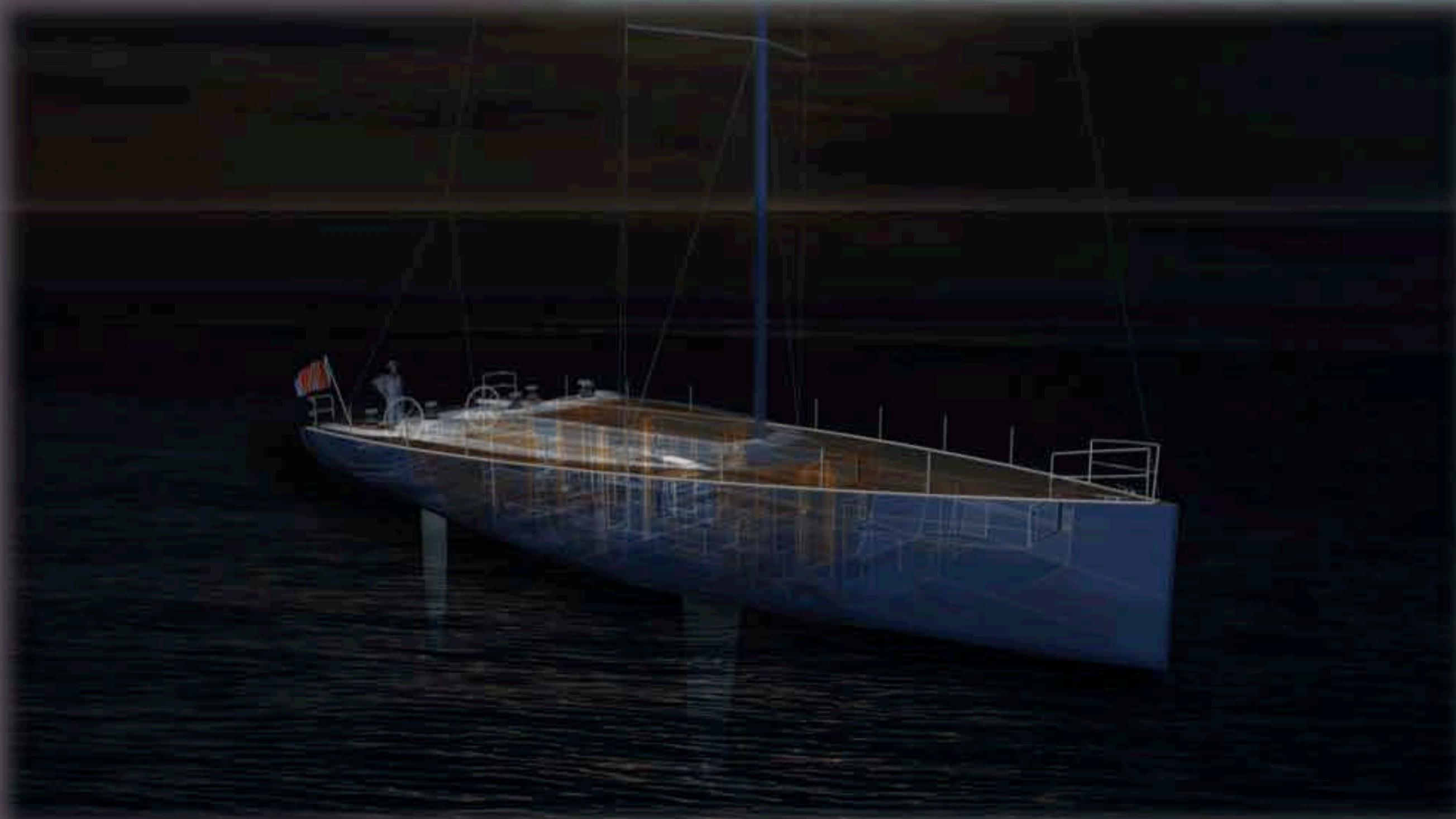
Night time perspective rendering – X-Ray effect and photographic insertion