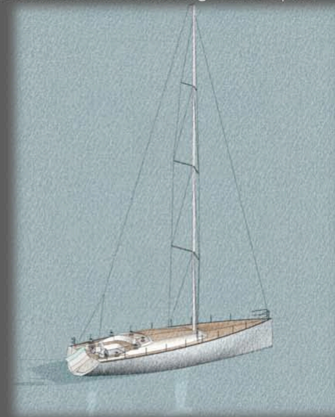
Day time perspective rendering – simulated pencil