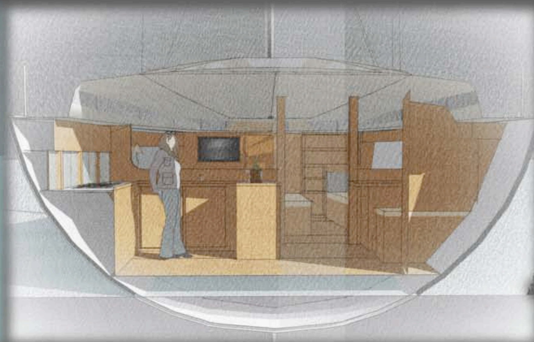
Perspective Transversal Section rendering – simulated pencil