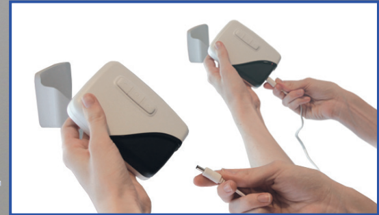
Up to 40 operations per charge