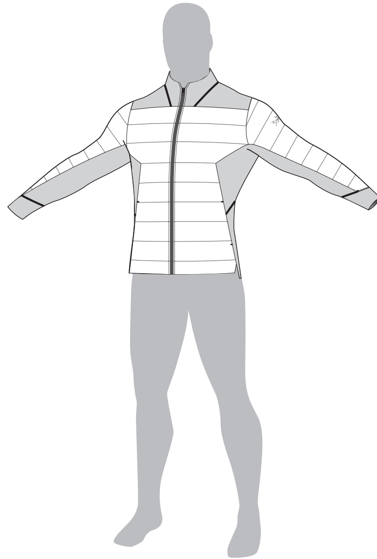
2ND LAYER // Taiga Jacket

When you want all-day comfort in a top that can be worn as an active baselayer, over a tee or button-down for office wear, or on its own for easy style, look no further than the Cuesta Henley.