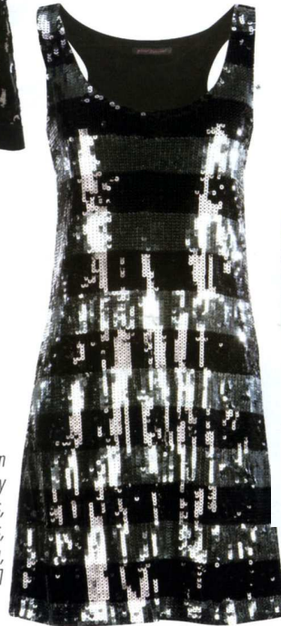
Betsey Johnson black and grey sequin stripe dress, $398, M'attias, Santa Monica, 310-576-4711