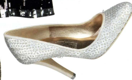
Salvatore Ferragamo silver paillettes round-toe pump, $440, Salvatore Ferragamo, Beverly Hills, 800-822-1956