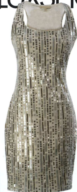
Melissa Odabash Pamela gold dress, $690, Amy B, Los Gatos, 408-358-8600; odabash.com