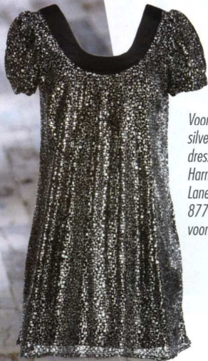
Voam by Joy Han silver puff-sleeve dress, $262, Harmony Lane, Beverly Hills, 877-777-8811; voamonline.com