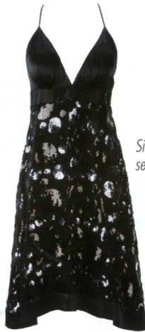
Single Rachel black strappy bra dress with sequin skirt, $326, buysingle.com