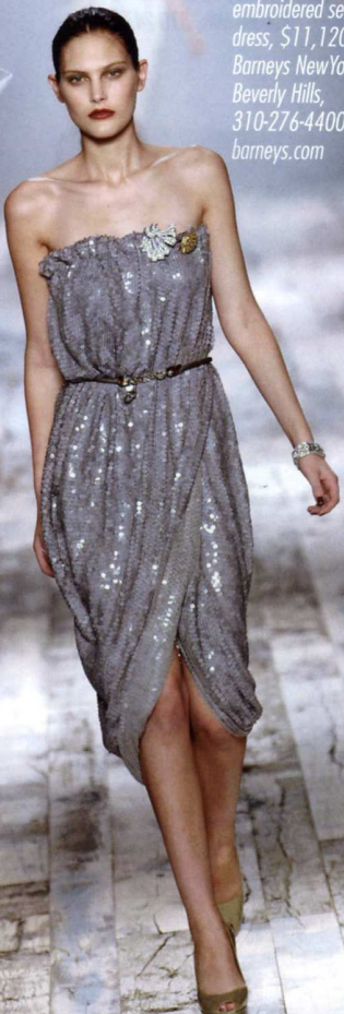
Lanvin platinum embroidered sequin dress, $11,120, Barneys New York, Beverly Hills, 310-276-4400, barneys.com