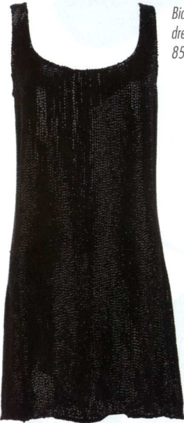
Bianca Nero black sequined chiffon mini tank dress, $435, Boulmiche, Beverly Hills, 310-859-0539; neimanmarcus.com