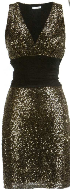
Rubber Ducky Marilyn gold sequin dress with black sash, $92, Anat B, Beverly Hills, 310-385-7917, anatb.com