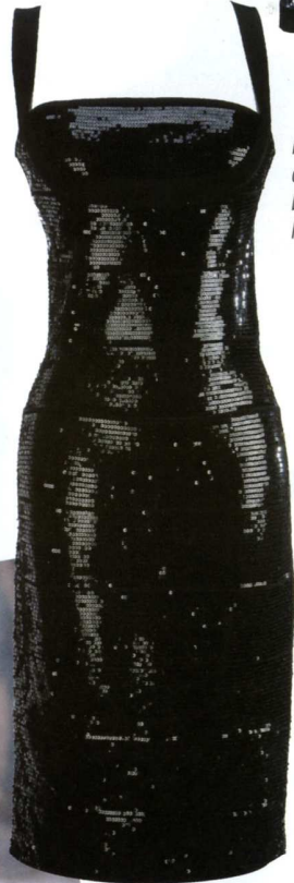
Hervé Leger sequin overlay dress in black, $2070, herveleger.com