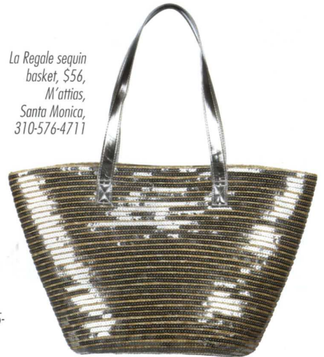
La Regale sequin basket, $56, M'attias, Santa Monica, 310-576-4711