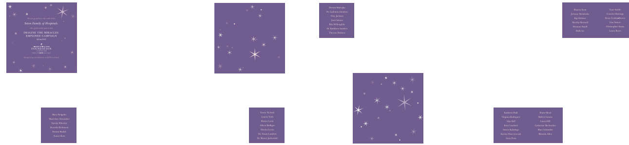
Layer 1—Top most level P1 back ground with P5 copy