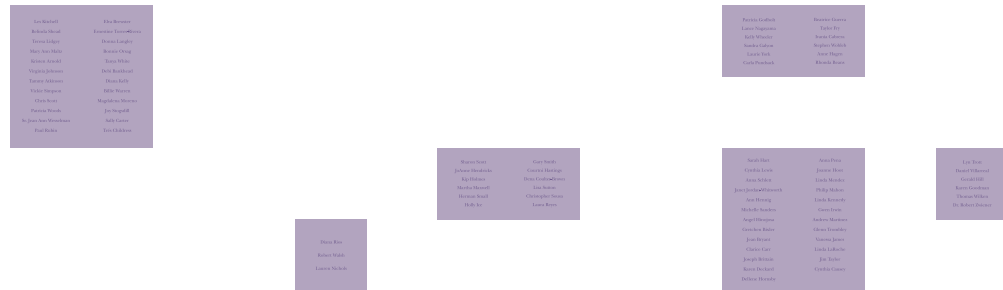
Layer 3 P3 back ground with P1 copy