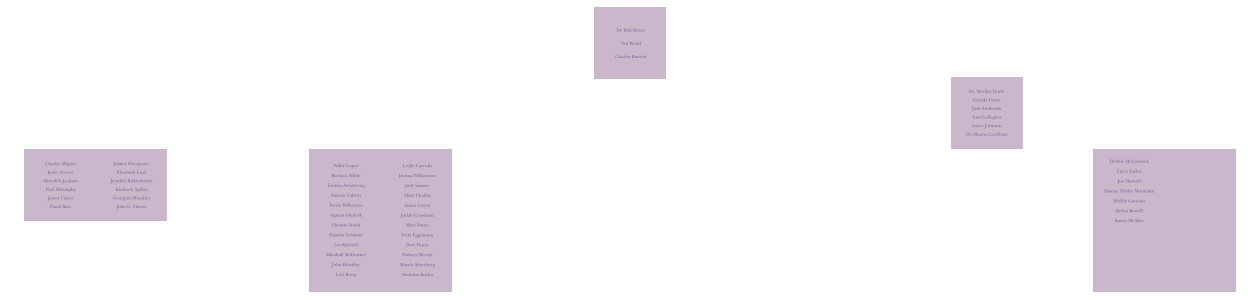
Layer 4 P4 back ground with P1 copy