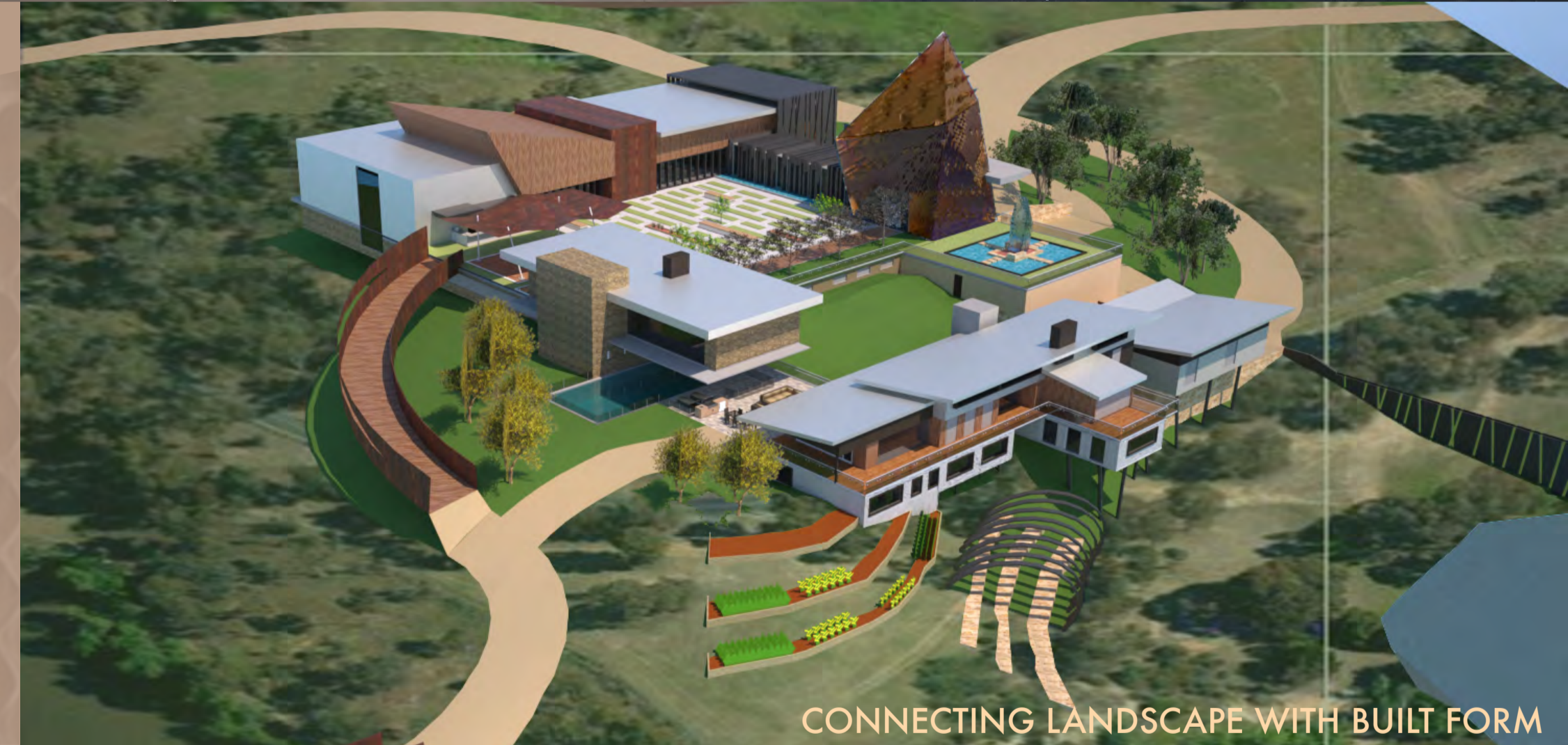
CONNECTING LANDSCAPE WITH BUILT FORM

THE SITE WILL PROVIDE A PLACE OF UNITY AND CELEBRATION FOR AUSTRALIANS, AND SHOWCASE THE NATION'S DIVERSITY AND TALENTS TO THE WORLD. DEDICATED AND INCIDENTAL GALLERY SPACES THROUGHOUT THE SITE AND BUILDING DESIGN WILL PROUDLY DISPLAY WORKS FROM THE AUSTRALIANA FUND, AS WELL AS MORE CONTEMPORARY ART BY LOCAL ARTISTS.