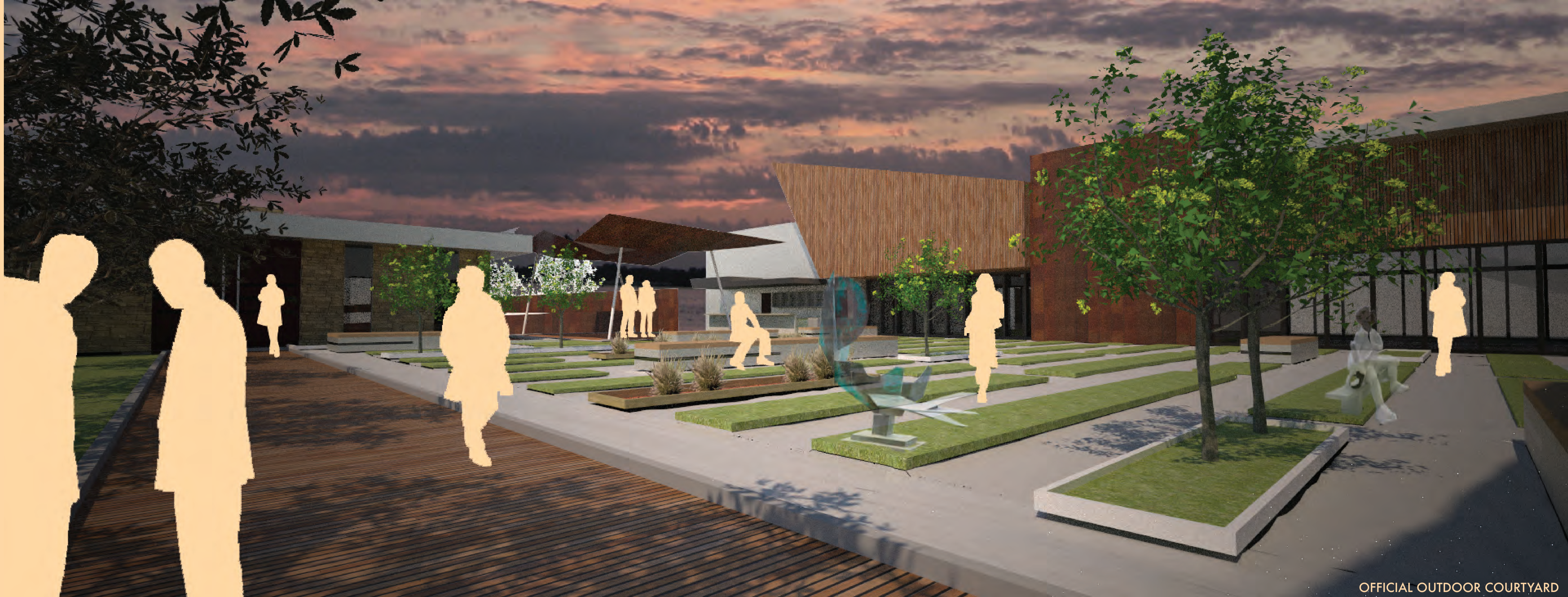
OFFICIAL OUTDOOR COURTYARD