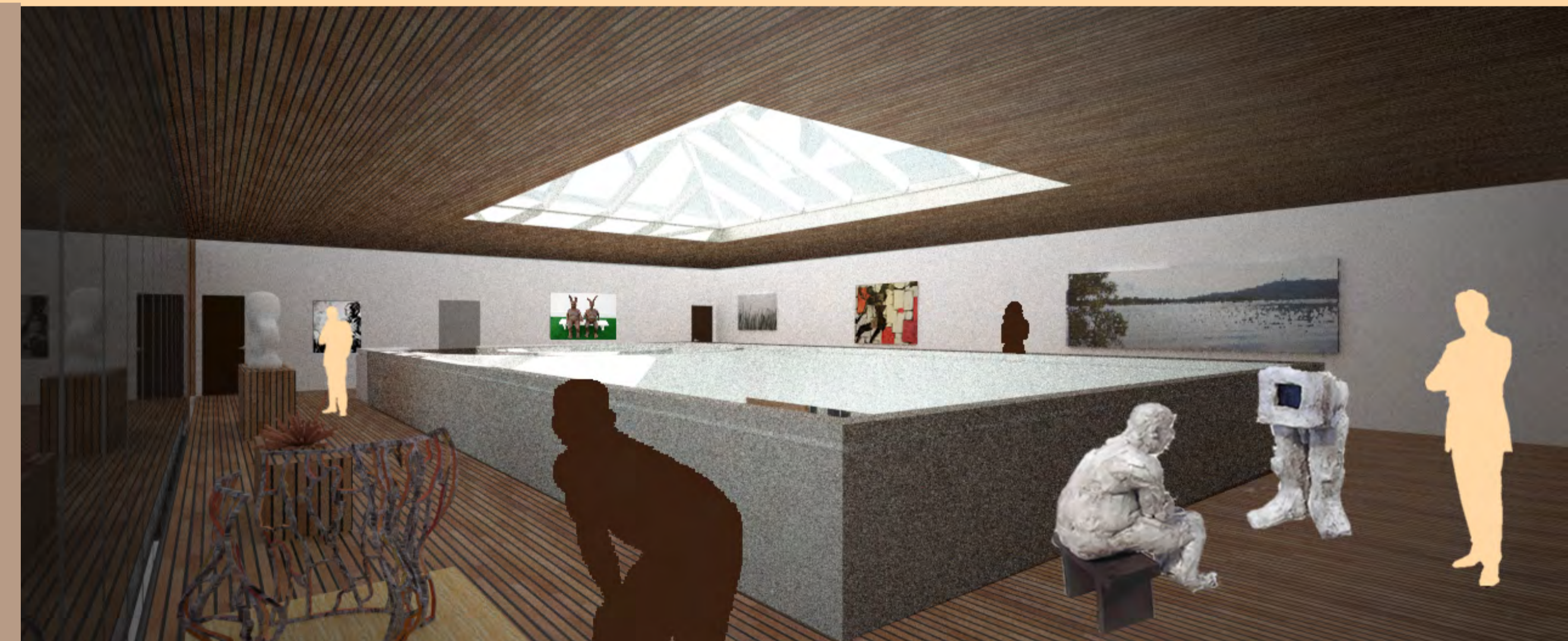
LEVEL 1 GALLERY EXHIBITION SPACE