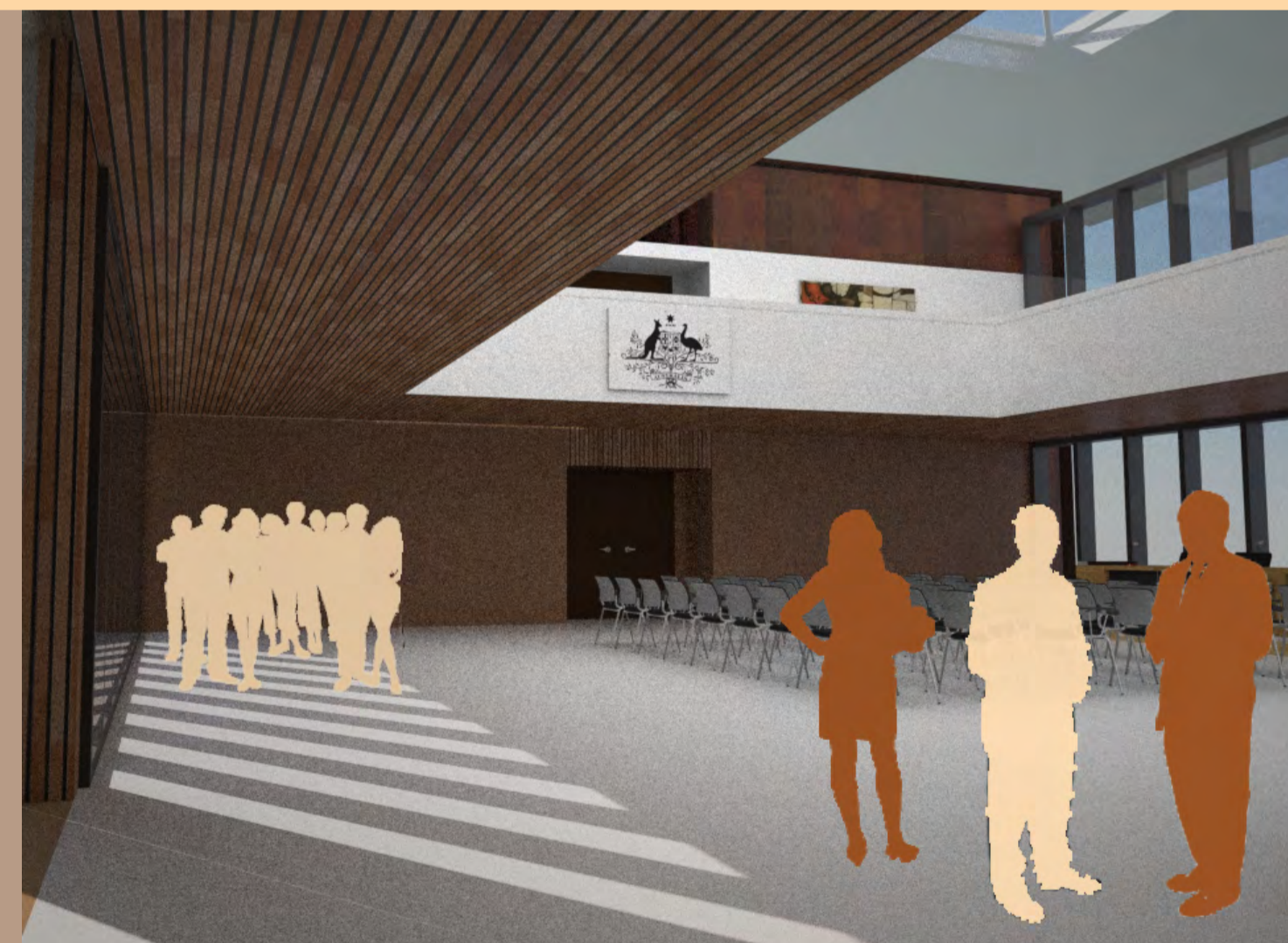
OFFICIAL FUNCTION ROOM