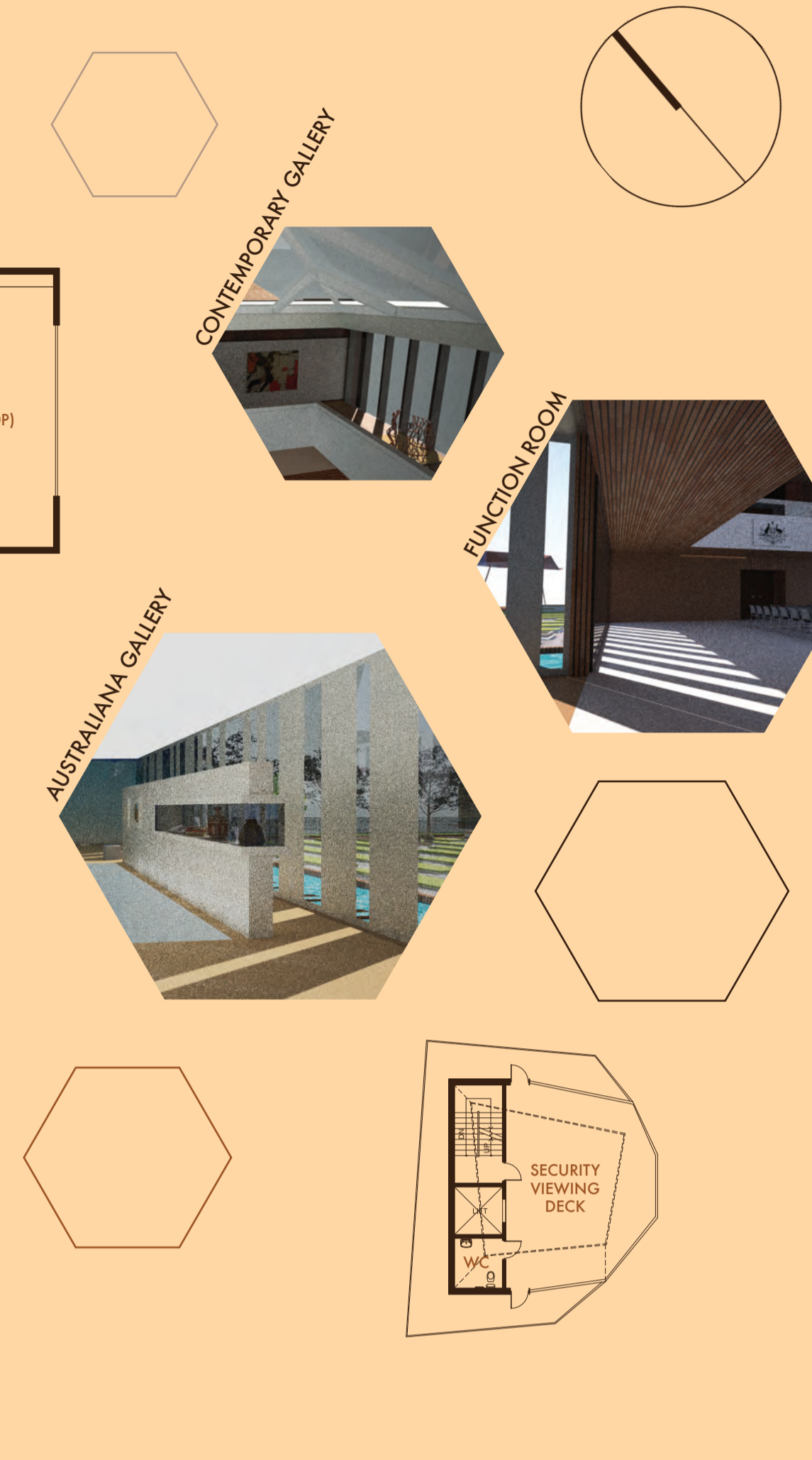
LEVEL 2 FLOOR PLAN 1:250