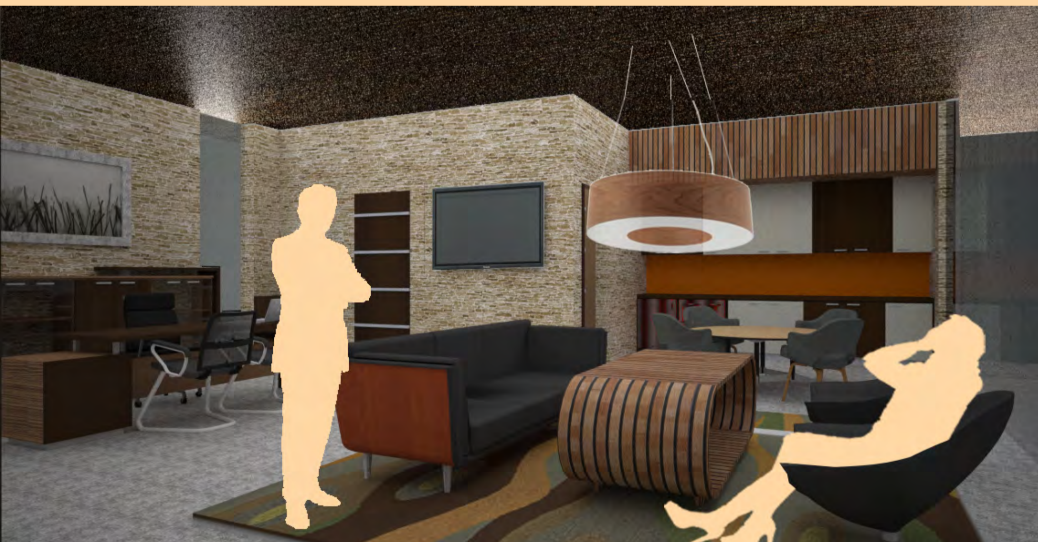
PRIME MINISTER'S STUDY