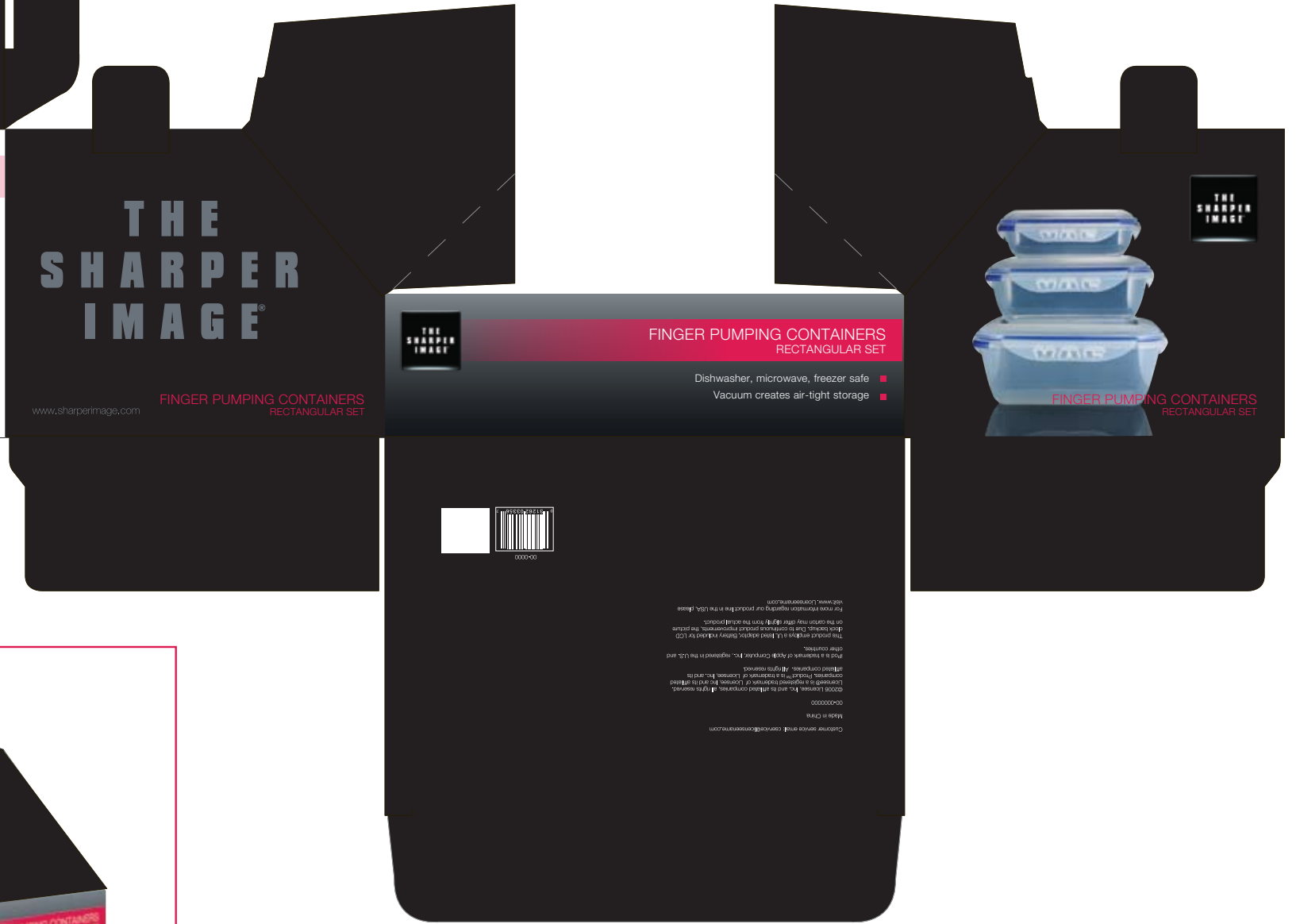
FLAT OPEN PACKAGING