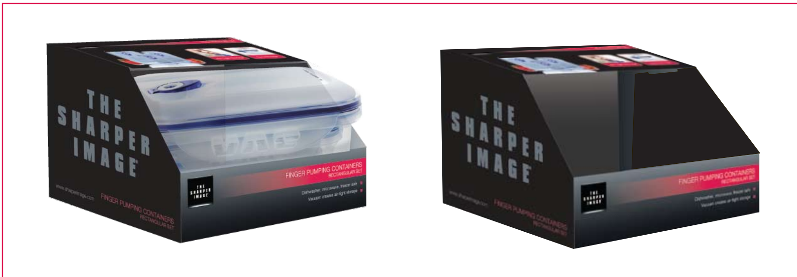
ASSEMBLED BOX-185mm x 265mm x 155mm (APPROXIMATELY 1/3 OF THE PRODUCT WILL SHOW)