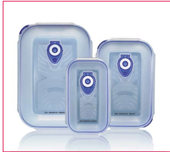
PRODUCT SIZE-18cm X 26cm