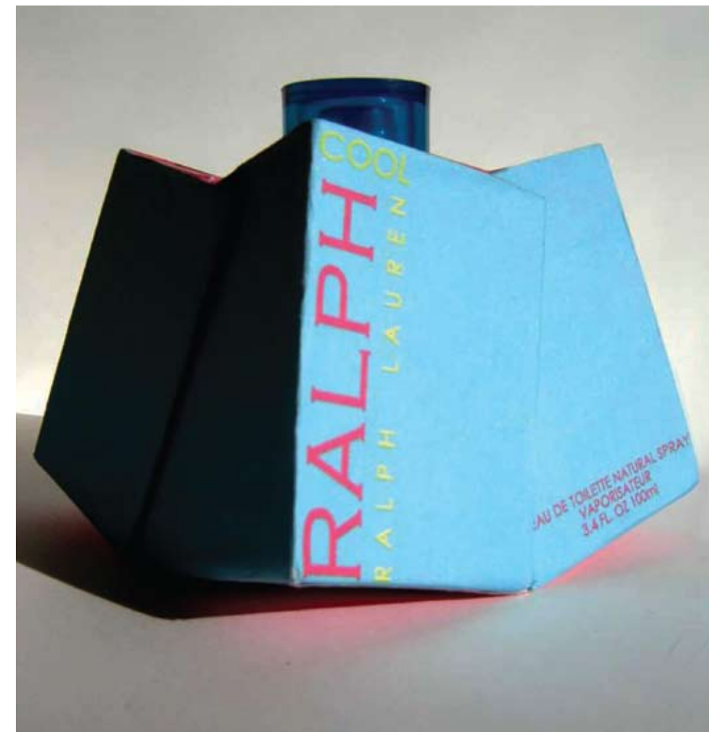
Biomimicry in Package Design Senior Year Base dimensions: 3.5 x 3.5 x 3 in. Chip board and Paper