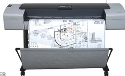
HP DESKJET 42” PLOTTER