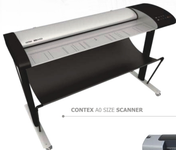
CONTEX A0 SIZE SCANNER