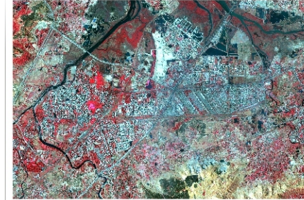
■ Urban Development Planning