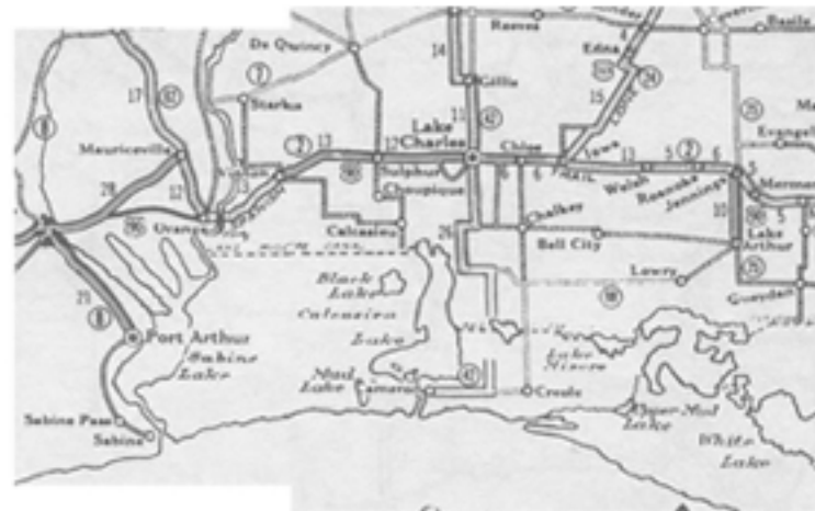
Road And Waterway Traffic 1926