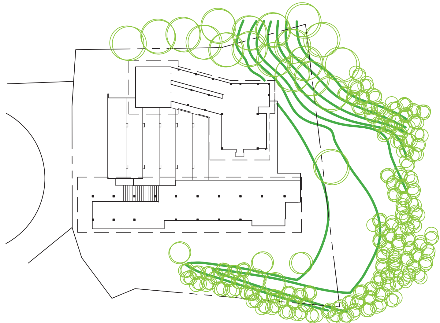
SITE PLAN 1/32"=1'-0" 0" 32"