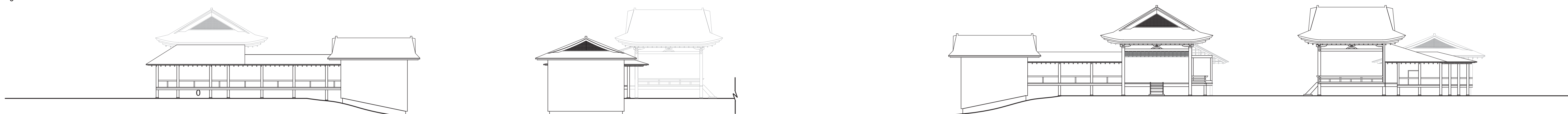
STAGE BUILDING ELEVATIONS