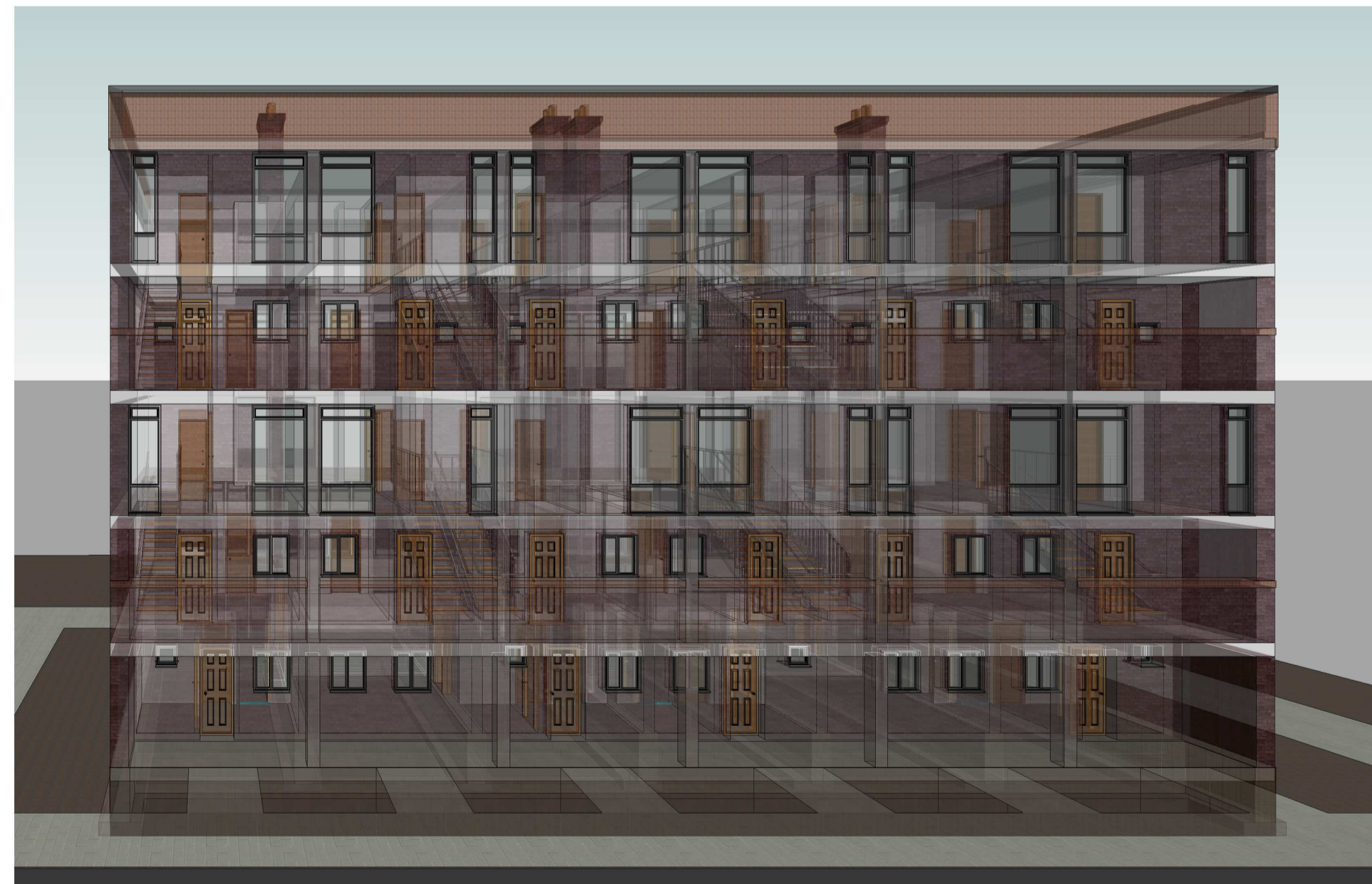
4 3D View mono 1