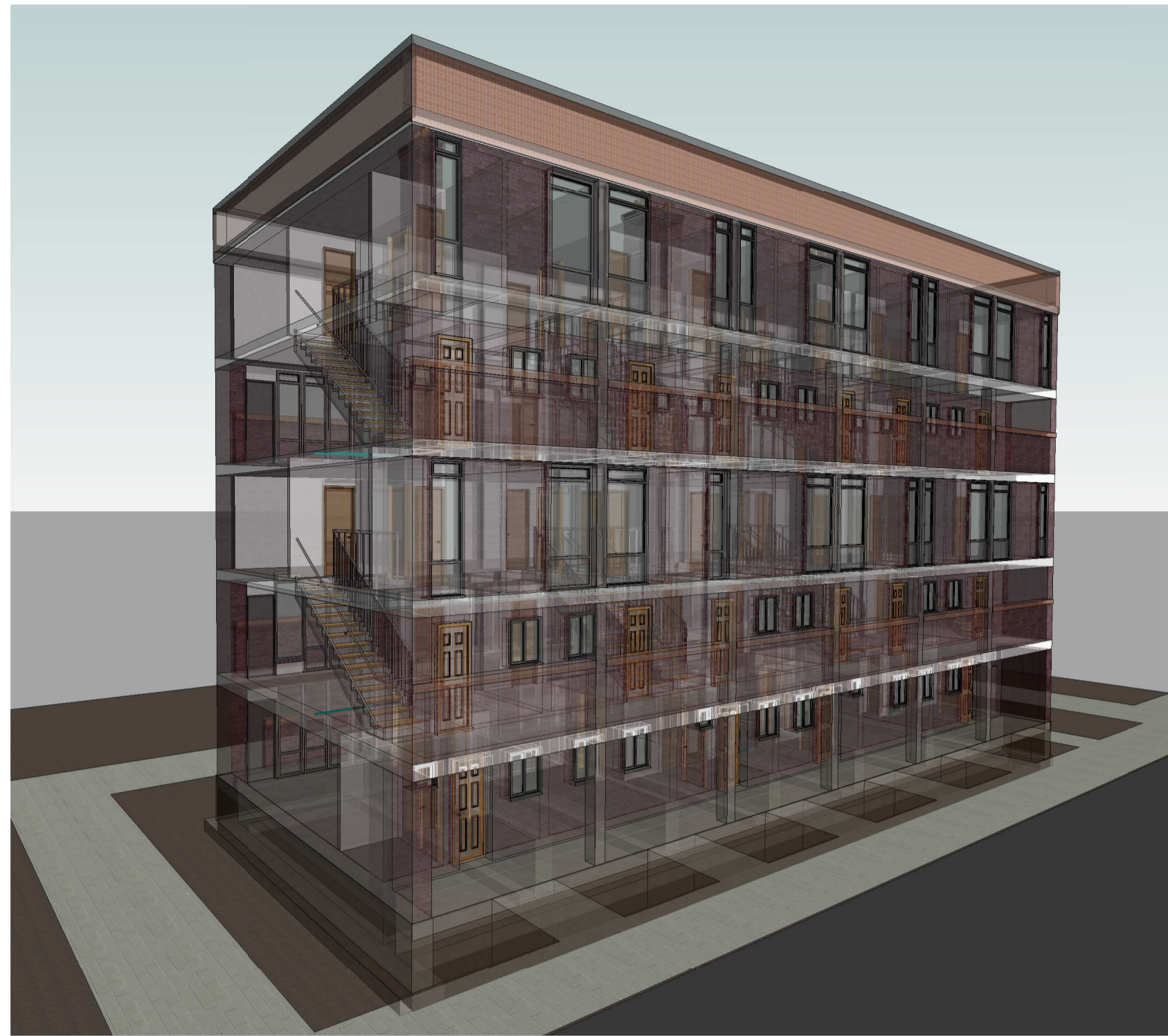
5 3D View mono 2