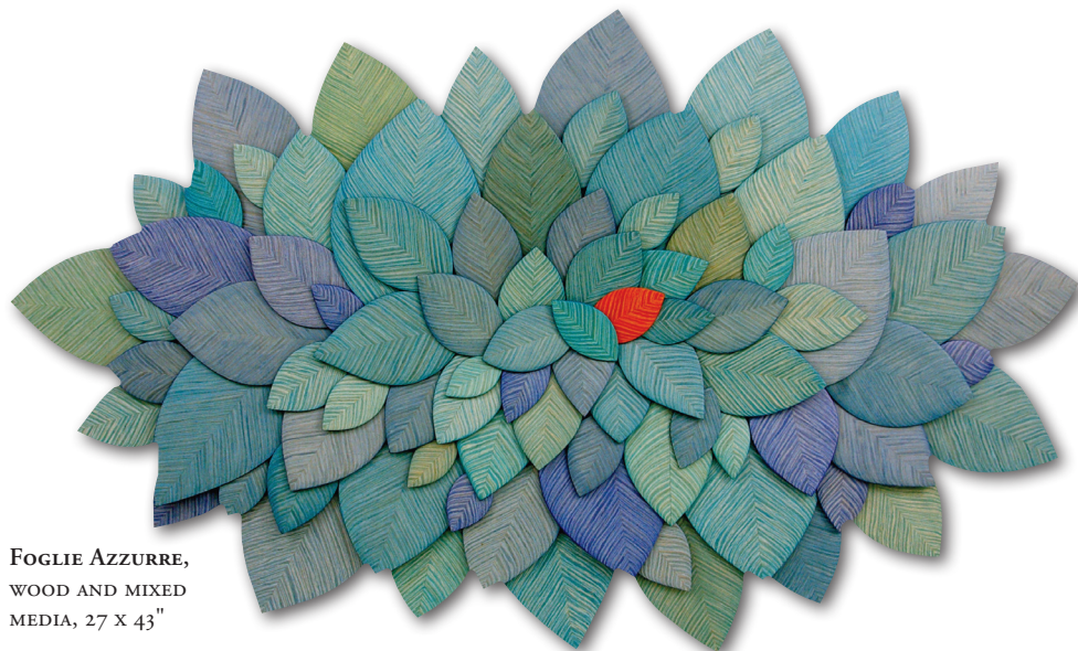
FOGLIE AZZURRE, WOOD AND MIXED MEDIA, 27 X 43"

“The leaf symbolizes human life itself; its