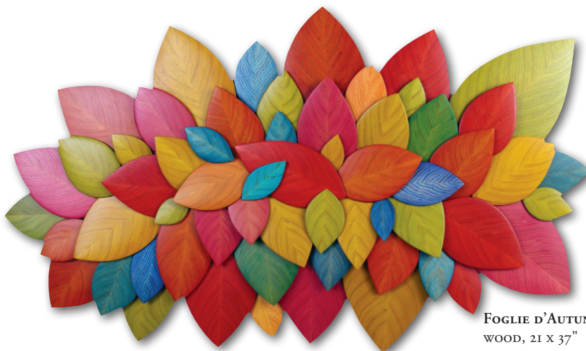
FOGLIE D'AUTUNNO, WOOD, 21 X 37"

cycles: birth, growth and death,” he explains. “Earth, water, air and fire also are often represented in my work. They express symbolic qualities like movement, vitality, fluidity, lightness, abundance, ardor or love.”