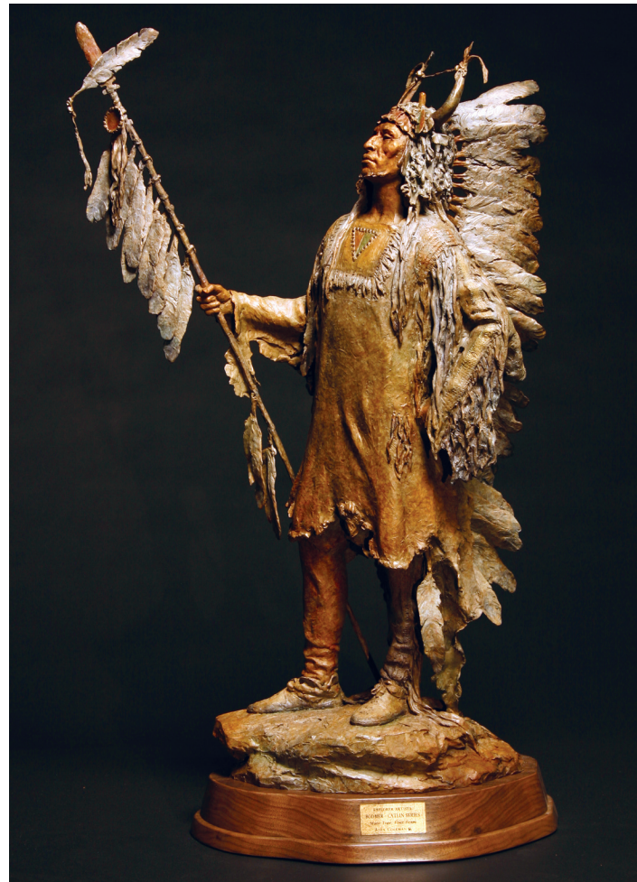
Mato-Topo, Four Bears , bronze, 36½ x 20 x 10½", ed. of 35