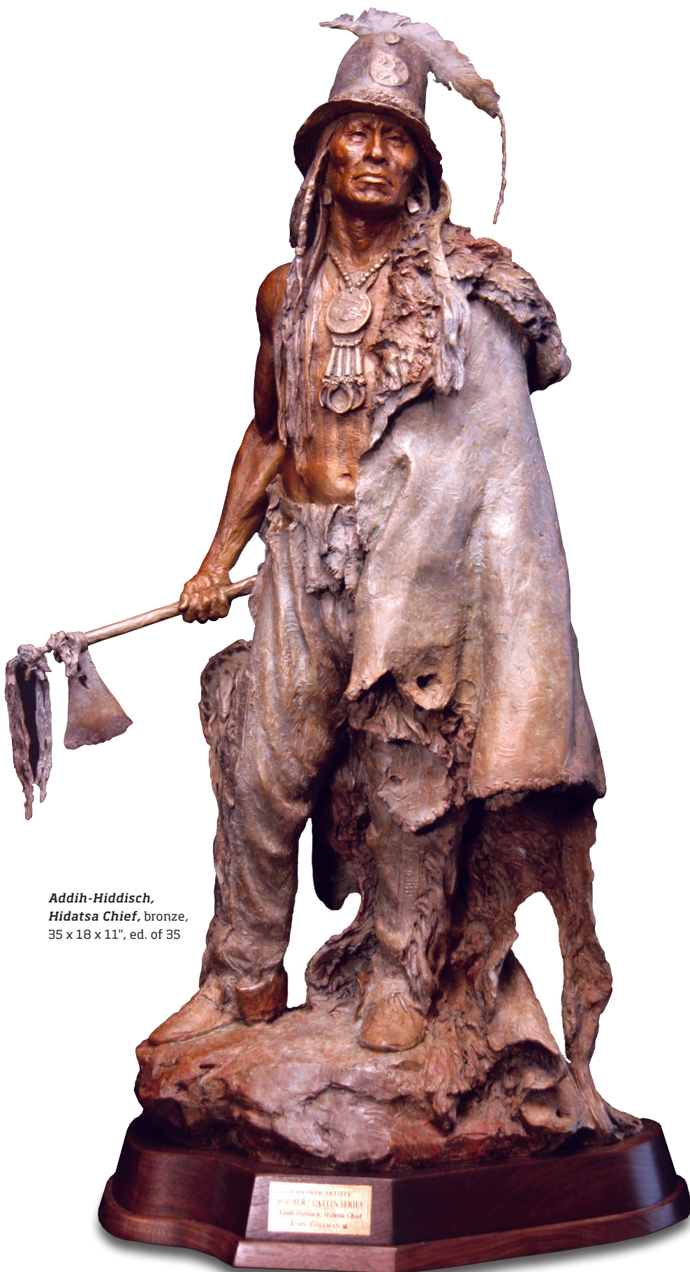
Addih-Hiddisch, Hidatsa Chief, bronze, 35 x 18 x 11", ed. of 35