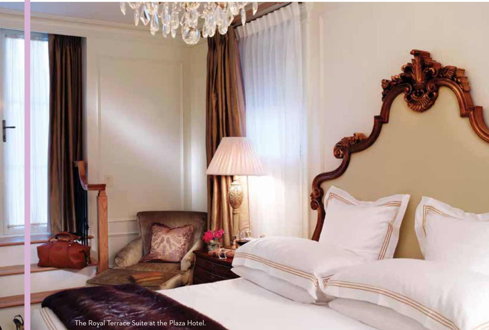
The Royal Terrace Suite at the Plaza Hotel.

spectacular's newest magical floating stages will transport viewers to worlds of whimsy and delight. For the 87th march, new floats include the dazzling Cirque du Soleil, the scrumptious Lindt Chocolates and the adventure filled Royal Caribbean float."