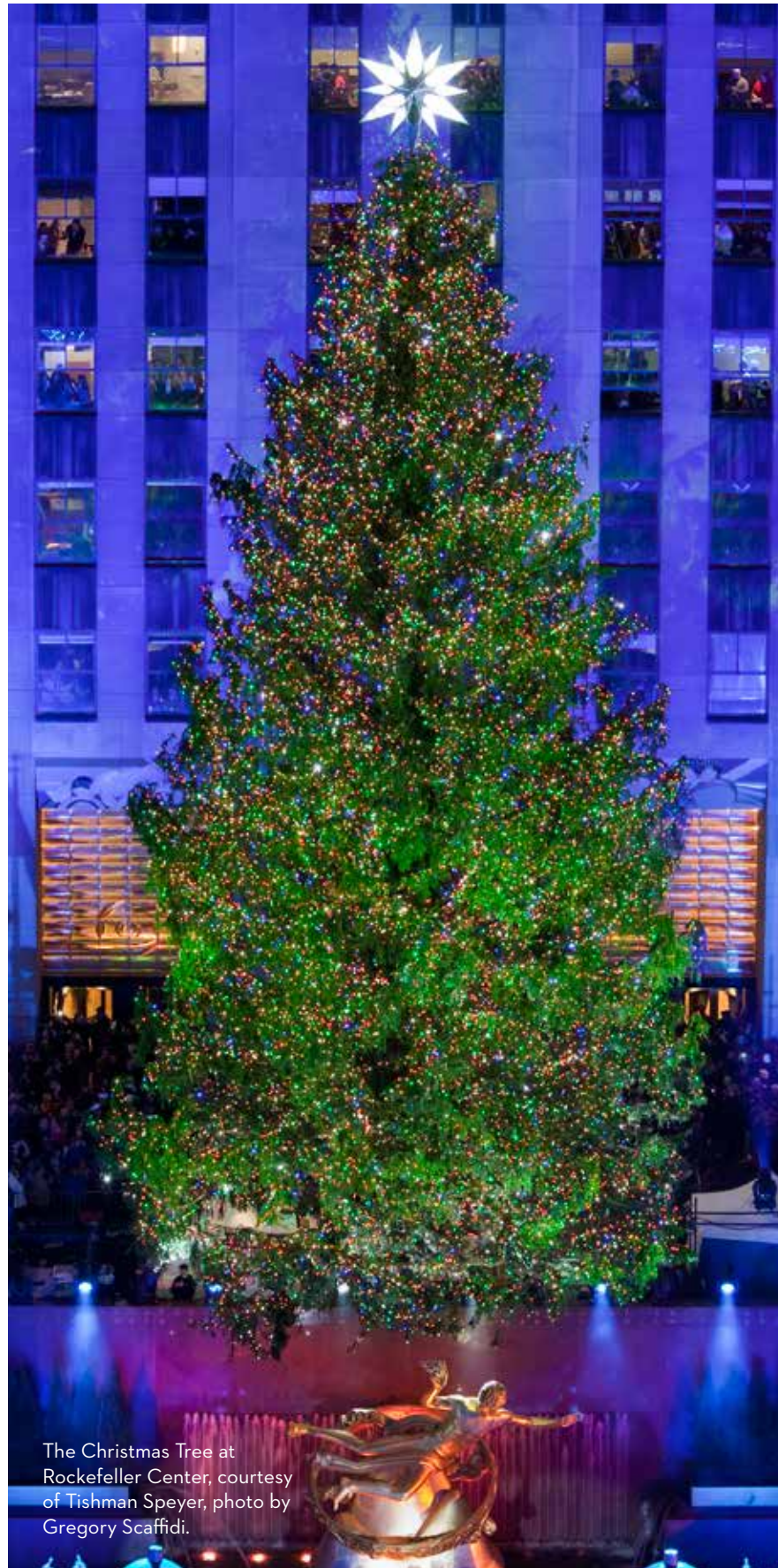
The Christmas Tree at Rockefeller Center, courtesy of Tishman Speyer