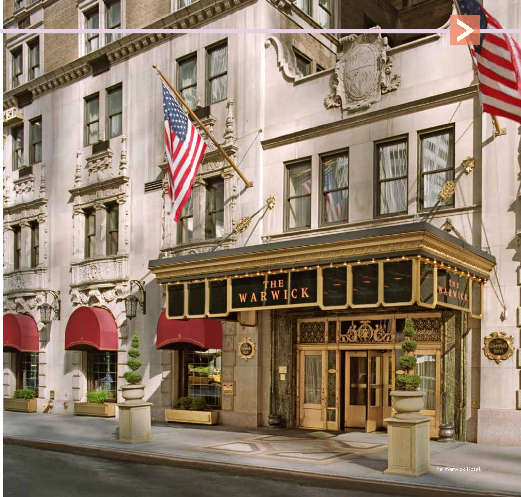
The Warwick Hotel.