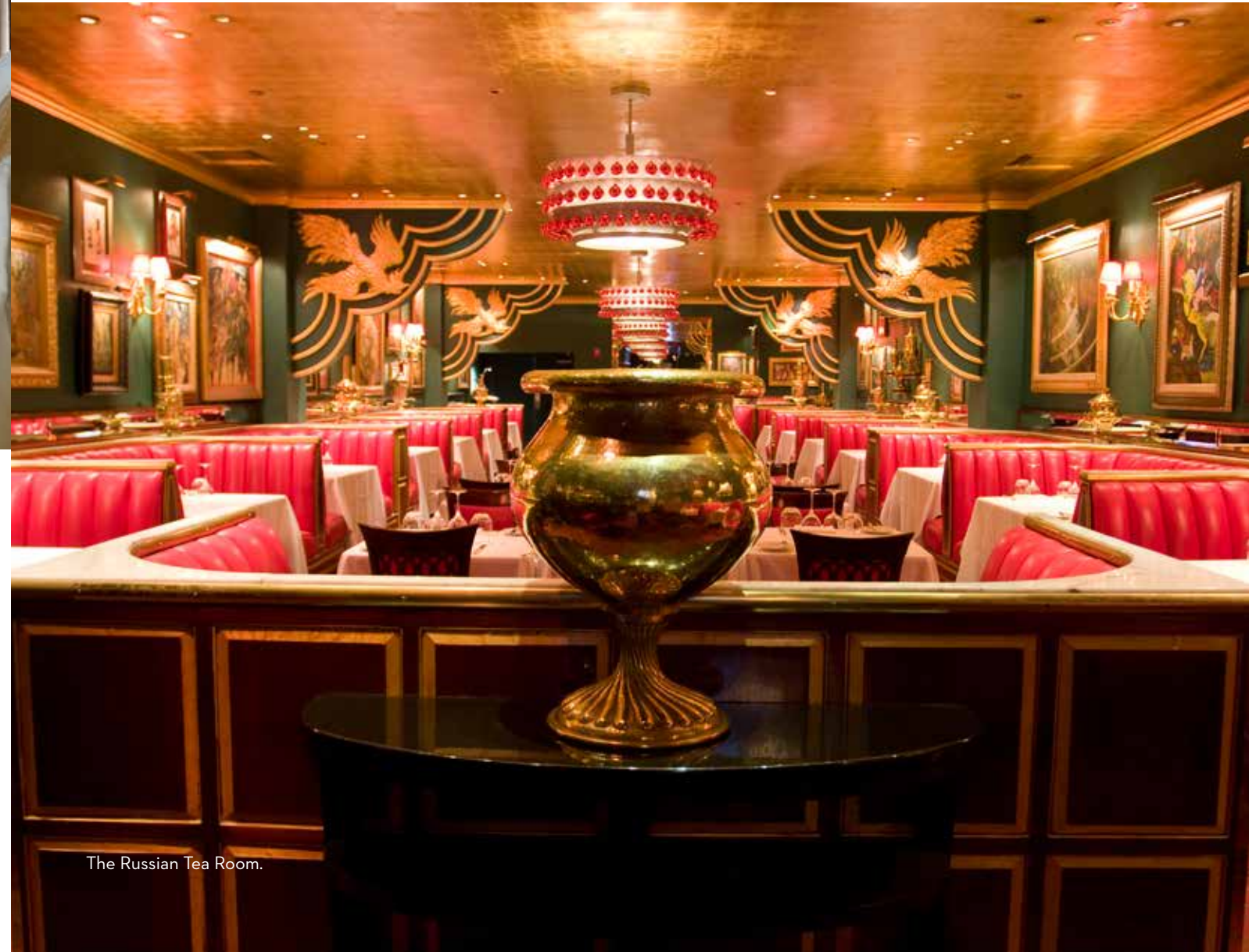
The Russian Tea Room.

After a little shopping, head over to The Plaza hotel for afternoon tea in The Palm Court, a quintessential New