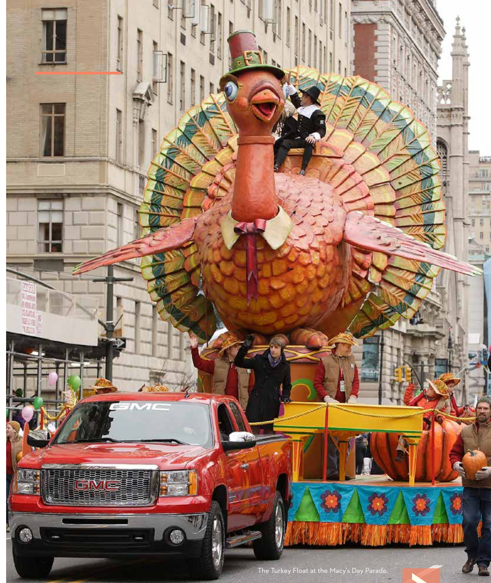
The Turkey Float at the Macy's Day Parade.