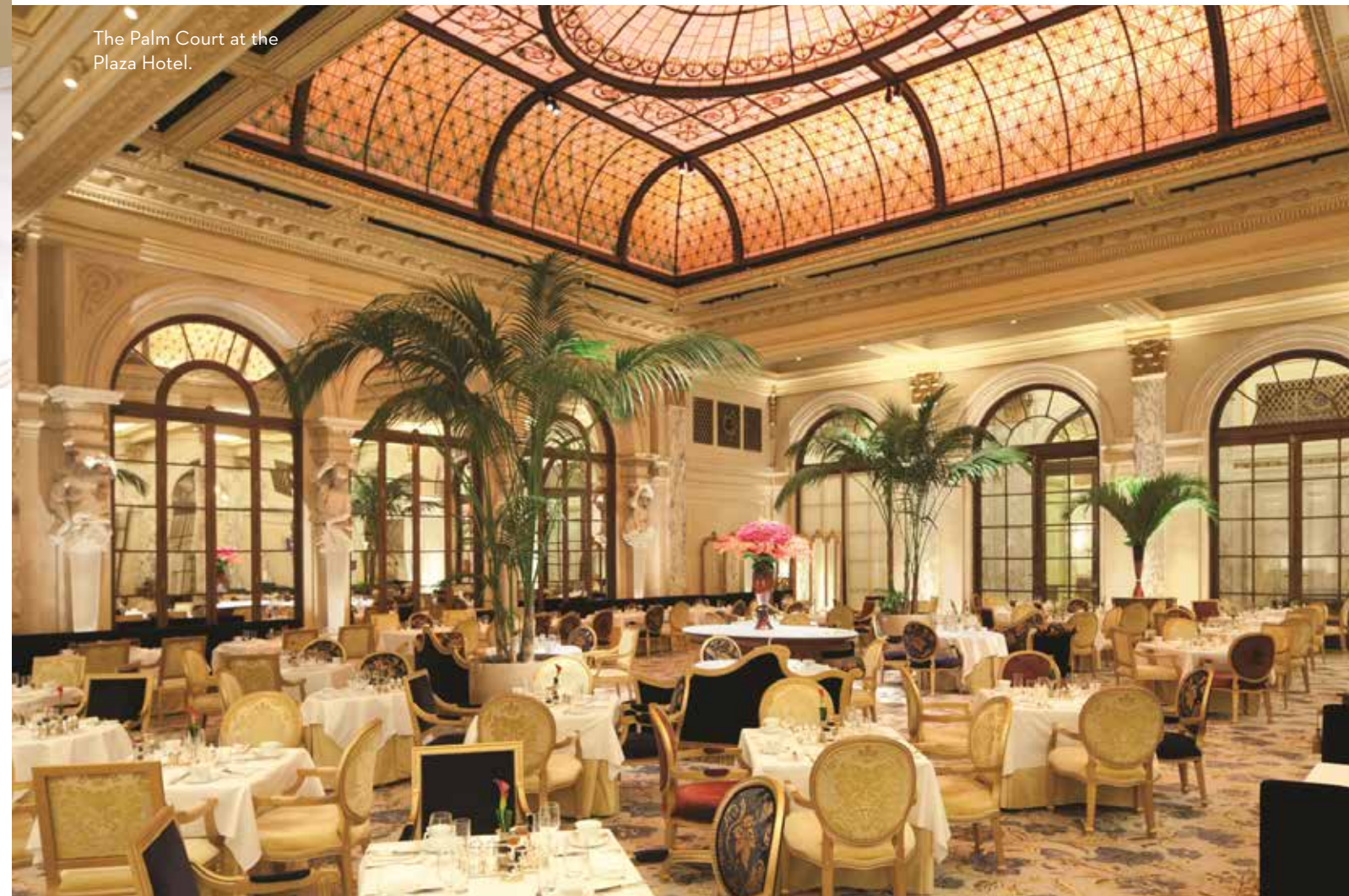
The Palm Court at the Plaza Hotel.