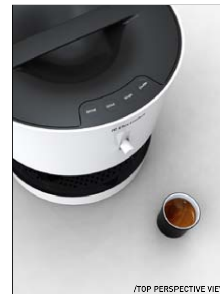
/TOP PERSPECTIVE VIEW