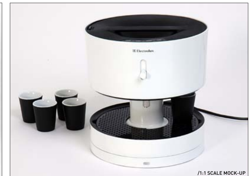
/1:1 SCALE MOCK-UP